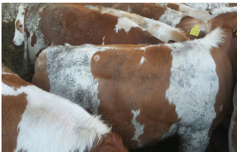
Figure 2. Gray-white circumscribed lesions on the body

Before the application of the therapy or the exposure of beef cattle to the sun and the addition of vitamin and mineral supplements in food, skin lesions were examined and their localities and