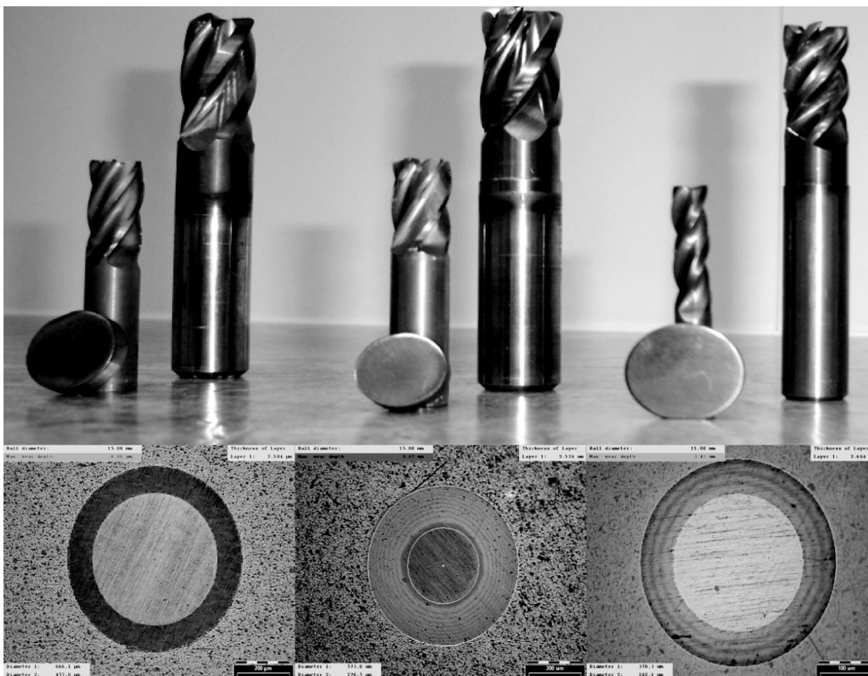
Figure 2. Mills with nanocomposite wear-resistant coatings and results of thickness monitoring of tool coatings using caliper «Calotest»

Leucosapphires are used to create high-brightness LEDs, for the development and production of pastes for the metallization of solar cells, which are one of the most