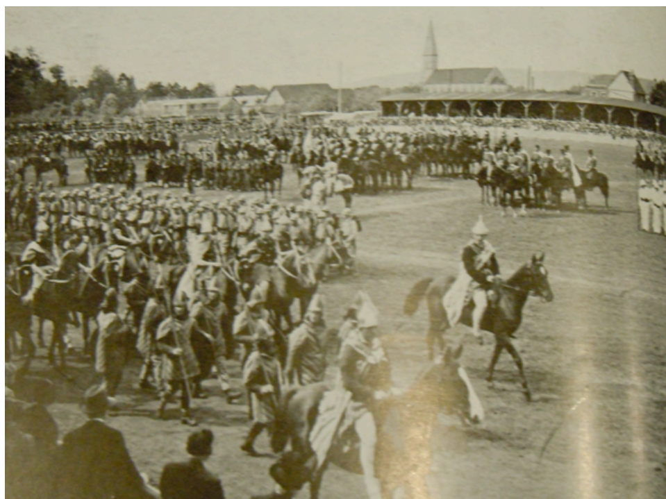
Figure 1.2. Military fête, Stade des Lilas, Rouen, 25 May 1931.

Any fête participants who missed the military fête had a second chance to see a parade of France’s past glories, neatly lined up in temporal procession. On the last day of the fête, participants commemorated Charles VII’s triumphant entrance into the city in 1449 by retracing