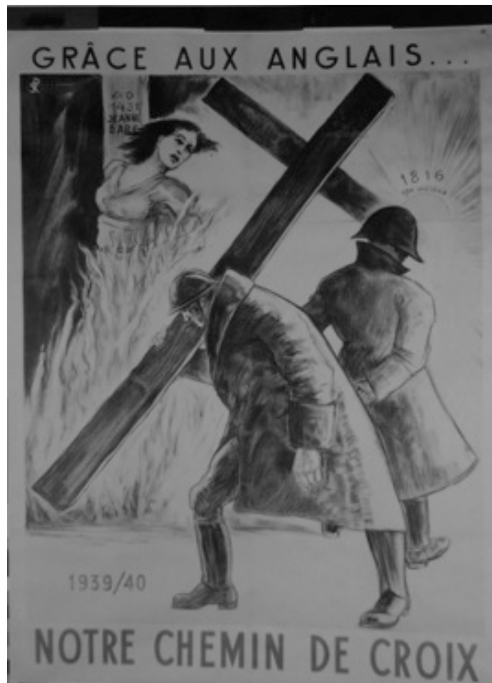
Figure 4.1. Grâce aux anglais...notre chemin de croix , anti-English propaganda poster, ca. 1940.

Jeanne d’Arc’s fêtes continued to be celebrated solemnly in the northern occupied zone, while in the southern unoccupied zone they became opportunities for elaborate displays of Vichy propaganda. The regime devoted considerable time and resources toward making these celebrations effective political demonstrations. Indeed, the government’s interest in Jeanne’s 1941 celebration might be gauged by the vast quantity of promotional posters it printed and