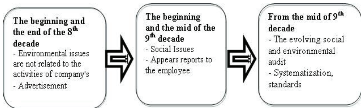
Figure 1. The stages of CSR reporting development