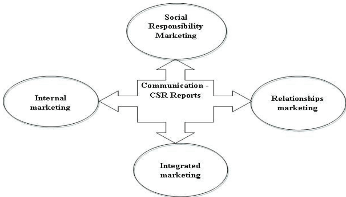
Figure 3. CSR reports in the context of a holistic marketing