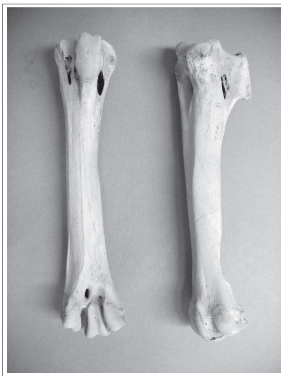
Fig. 4. Pelican bones ( Pelecanus crispus ) from the Rosenhof Mesolithic site in northern Germany (about 4600 BC).

In summary, genetic analyses of archaeological bone plates show the Holocene distribution of sturgeons