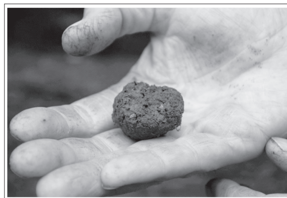
Fig. 2. Coprolite from the Beregovaya 2 site (the Urals, Stone Age, about 7500 BC).

A well-preserved coprolite was excavated recently at the Beregovaya 2 site, one of the rare Stone Age bog sites in the Urals region with excellent preservation conditions for organic material. The ZBSA gene lab conducted a study to determine the species of origin