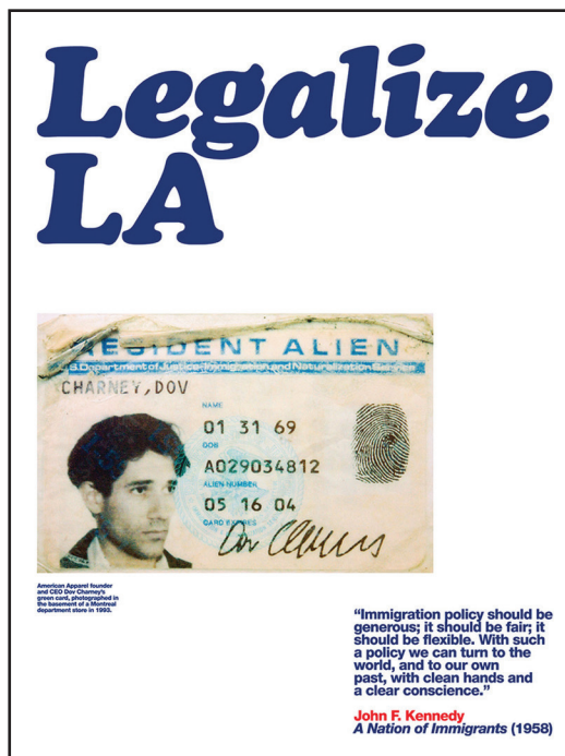
Fig. 3. American Apparel, Inc. Legalize LA . 2009, < http://americanapparel.net/advertising >.

The placement of American Apparel ads in major newspapers, on billboards, and the CEO's own use of provocative language in interviews constitute deliberate attempts to create a brand based in ethical capitalism and garner media attention. Although the ads do critique failed U.S. immigration policies, they do not offer any