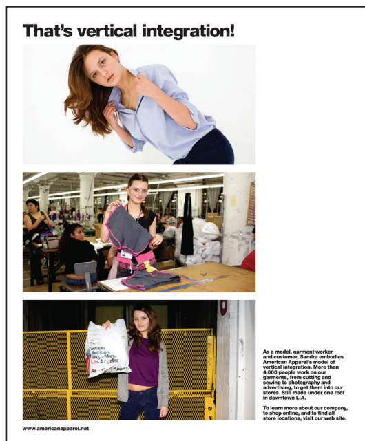
Fig. 1. American Apparel, Inc. Vertical Integration . 2009, < http://americanapparel.net/advertising >.

Consumers choose to buy clothing based on a code of ethics because they are concerned with the quality and production of the garment as well as the social recognition that they receive from wearing it. Specifically, ethical consumers list the following values when they rationalize their consumption choices: the purchase furthers their personal and emotional well-being, and the purchaser believes all people deserve equal treatment and opportunity, to care for the weak and share wealth more equitably, to promote conservation of resources and to help end pollution, to provide for future generations, to feel self-confident, to