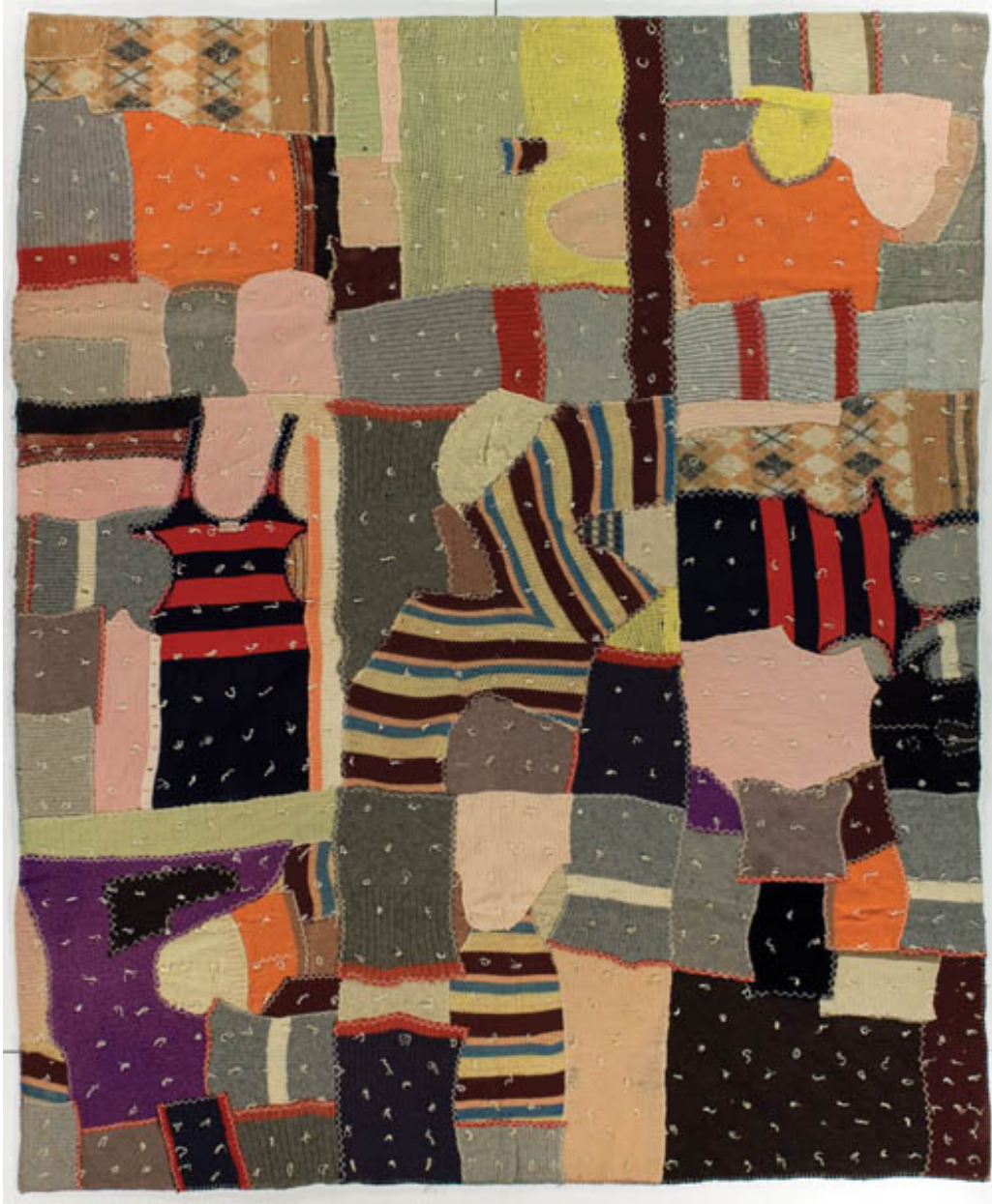
Figure 11. Crazy Quilt . Maker unknown, c. 1930-1945. International Quilt Study Center, University of Nebraska-Lincoln, 2003.003.0140. (From what once was the Holstein collection.)

The process of spending time on something that avoids this dynamic is necessary for the very envisioning of a society that is not structured around profit-making. Clearly, many hobby quilters see quilting as an escape from the pressures of a capitalist world, because for them quilting is a