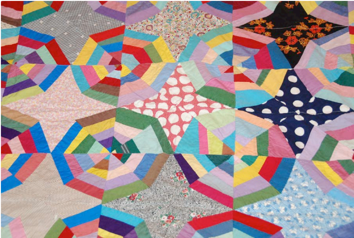
Figure 13. Scrap Quilt . Makers unknown., c. 1960s.

and so it exemplifies a true scrap quilting aesthetic, as opposed to the superficial “scrap quilting look” that is common in the current hobby quilting world, which is really focused on a certain conformity to standards of precision and design which feed the commercial markets for tools that make precision easier and for exciting new cotton fabrics.