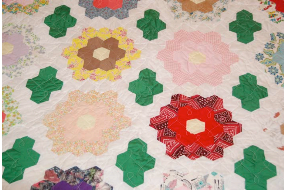
Figure 4. Flower Garden . Pieced by Gladys Burns, binding by Helena Pauls, c. 1970s-1980s.