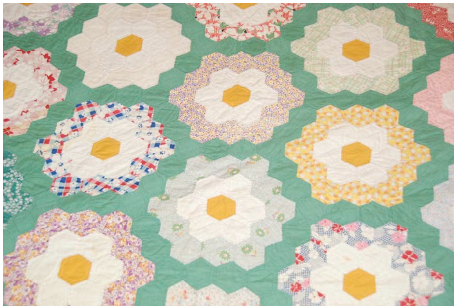
Figure 5. Flower Garden . Nelida Vessot Gordon, c. 1950's.

of “flower petals,” as well as its more-limited color palate for the outer rings of “petals.” These two quilts are only two possible interpretations of the “Flower Garden” type block, which is only