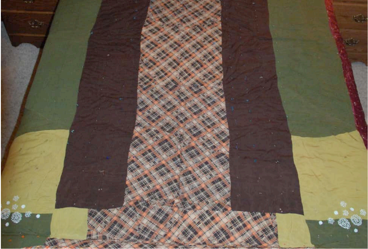
Figure 10. Utility Quilt . Nelida Vessot Gordon, c. 1930s-1940s.

trends have allowed a certain degree of re-embracing utility and creativity in the domestic sphere, now in a postmodern, self-conscious way. Websites such as Pinterest.com abound with examples of many people's enthusiasm and strong desire to create beautiful items of utility.