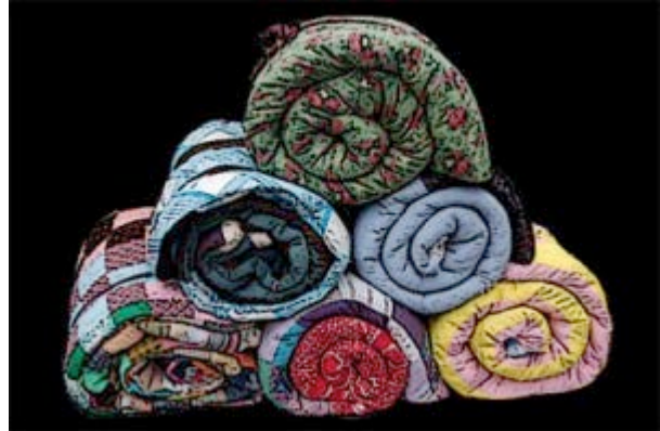
Figure 9. Instructions and Sleeping Bags . Jim and Flo Wheatley, The Sleeping Bag Project .

recycled fabrics and distributing them FREE to those who need them. Our only purpose is to help the homeless be warm until they can be helped or healed by others in our society.” For people in need of warmth on cold nights, a simple yet cushy sleeping bag could be a beautiful thing.