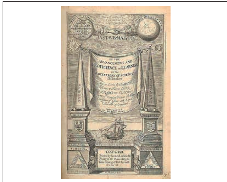
Frontispiece of Francis Bacon's Of the Advancement and Proficiency of Learning (1605)

Specifically, imagination was understood as one of the internal perceptual faculties located in the sensitive soul, not in the intellectual soul - where the faculties of the intellect and the will would then process the images formed in the mind's eye. This creative capacity of imagination intensifies the psychic power of being able to continually visualize and feel the forms and emotions which are not immediately present to the external senses. In De Anima , Aristotle develops this idea of the ability to see things even with eyes closed - being awake or dreaming. It is a way of activating reminiscence, but of transcending it as well, through the creative contours given to recollected forms, emotions and ideas. Such a topic was thoroughly explored in lyric poetry throughout the Renaissance, and gave a doctrinal basis to many poetic images of love and longing. In Sonnet 27, Shakespeare takes up the imagery of a mental journey which is able to materialize, through the faculty of imagination, the absent body of the persona's lover during a dream: