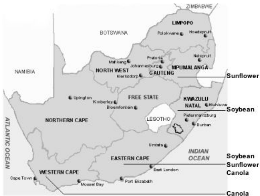
Figure 2: Envisaged biodiesel feedstock production in South Africa

examine the environmental performances of different cropping systems, then an area of land planted has been used as a functional unit (Kim and Dale, 2005). When fuels are compared, then the functions of the fuel products are normally used; for example, the work delivered by a diesel engine or a certain mass transported over a distance (Sheehan et al. , 1998).