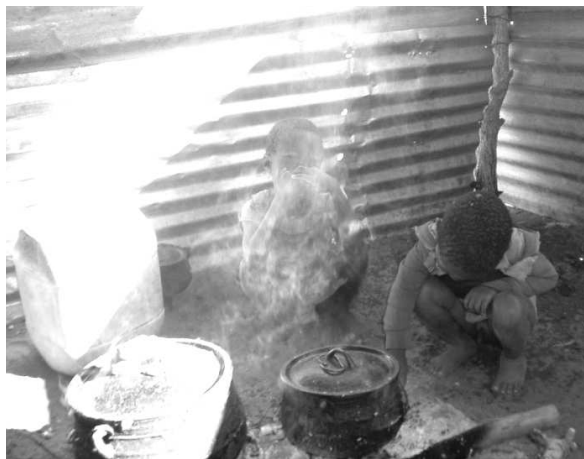
Figure 2: Children exposed to indoor air pollution in this study

Homesteads usually had two structures relevant to burning. The segotlo was an outside burning area surrounded by a wall of interwoven dried sticks (approximately 160 centimetres in height) that served to protect the fire and occupants from windy conditions prevalent in the area. The segotlo served as an outside kitchen where most of the cooking and water heating was done during the day. During summer, when the need for space heating was minimal, cooking and water heating was undertaken exclusively in the segotlo . During winter, however, fires are burned in the segotlo during the warmer parts of the day but moved indoors into the inkwe (indoor burning room where most of the exposure occurred) during colder parts of the day. Approximately 30% of households, however, did not bring a fire indoors and burned exclusively outdoors. Children less than five often followed their caregivers around and were found to spend between 52% and 61% of the total time that indoor fires were burning in the inkwe (Barnes et al., 2005).