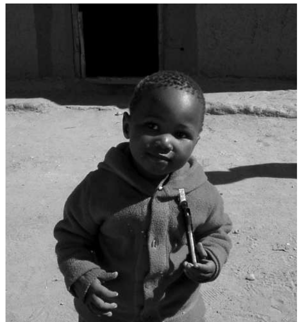
Figure 4: Study child with attached carbon monoxide diffusion tube