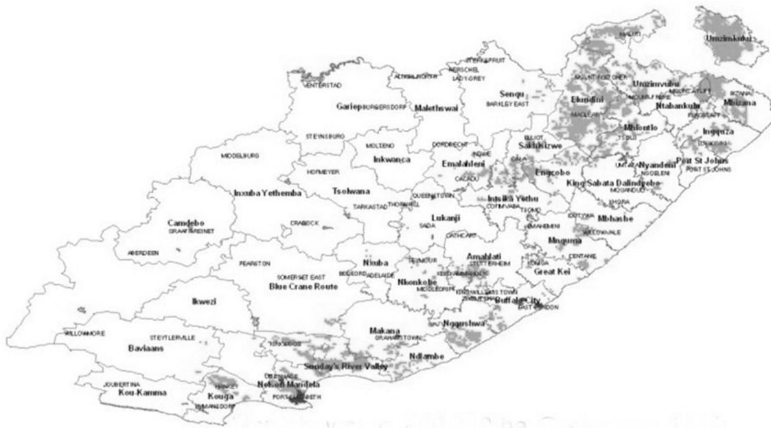
Figure 2: Areas suitable for cultivation of canola in the Eastern Cape Province of South Africa