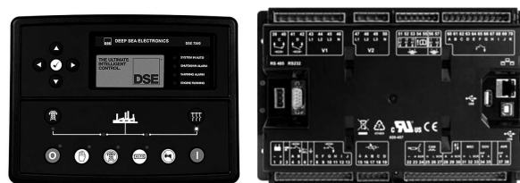
Figure 3: Modern multi-functions numerical relay manufactured by deep sea electronic (DSE, 2014)

In the 1990s, the notion of integrated protection and control became very popular and benefited full advantage of microprocessor technology, for protection, monitoring, control, disturbance and event handling, and communication. The relays' volumes as well as wiring were significantly reduced due to the integration of functions and the use of serial communication.