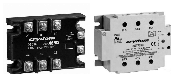
Figure 2: Example of a solid state relay manufactured by Crydom (Crydom, 2012)

During the peak famous period of these solid state relays, another generation of protective devices was being set in way to see the light; it was the digital technology.