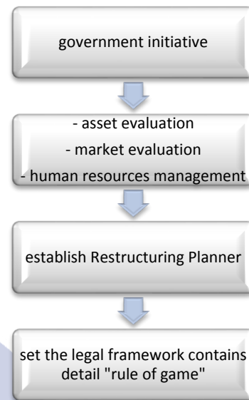
Figure 3 Staggered Precondition Process

From the figure above, the role of government become very essential since the restructuring process can be considered as its initiative. A special body should be created to formulate the scenario of restructuring. This body can be consisted of Ministry of Transportation, Ministry of State Enterprises, and Ministry of Finance. But, before that process is being carried out, an assessment of asset, market, and human resources is absolutely needed to measure the potential and readiness of railway to be restructured.