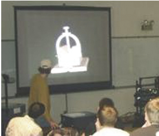
Figure 2 Second class test

In the fourth test class, held at the second community college, the instructor covered using