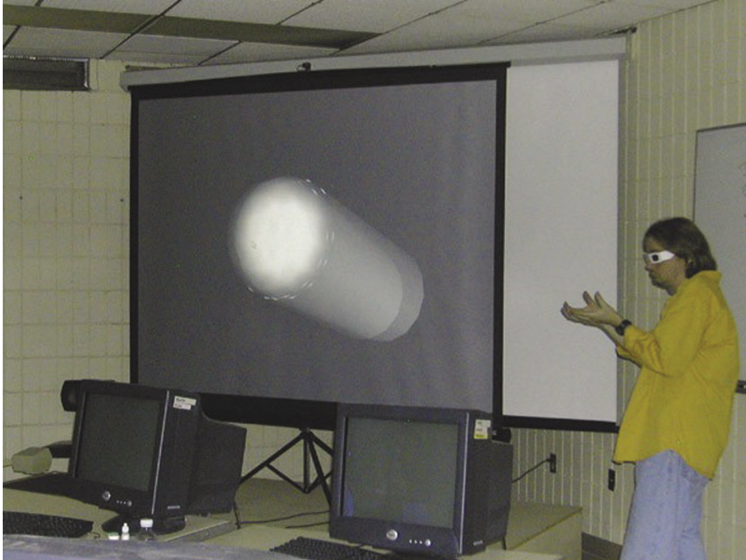
Figure 4 Fourth class test

Visual Basic programs to drive a CAD software tool for creating generic geometric forms representing mechanical parts. First, students were asked to develop a program that would produce a cylinder and a sphere with specific dimensions. They were then asked to verify their results against a VR model. Next, they were asked to modify their programs to make the center of the sphere coincident with the center of the cylinder. Again, students used a VR model to verify that the output met their expectations. Finally, students were asked to visualize shortening the cylinder by a specific amount and to produce the change by editing their programs. After their programs produced the change, they were again asked to examine a virtual model and to compare their results with their expectations (Figure 4).