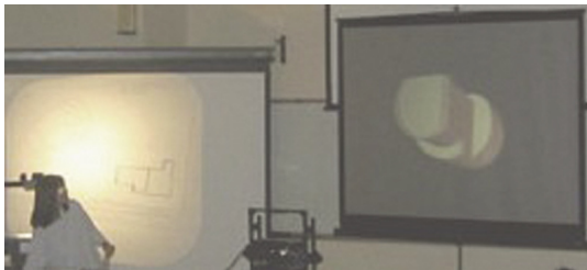
Figure 1a (above) & 1b (below) First class test

Introducing new technology into classrooms also brings in the requirement for course reformation. This paper describes a teaching and learning experience in which VR tools were introduced into design and technical graphics courses at three educational institutions. In particular, findings are presented that show how the implementation of VR technology affected and changed pedagogical practices between instructors and students in classrooms at the three educational institutions. After introducing VR tools into courses, gains in student visualization skills were also measured. Implementation findings provide insights into how to use VR technology in design and technical graphics education, which can help instructors