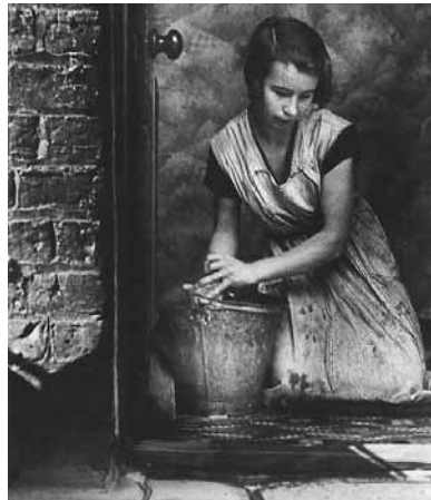
Figure 3-4: 'Young Housewife in Bethnal Green', 1935.