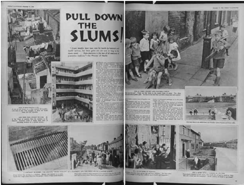
Figure 1: Weekly Illustrated , 'Pull down the Slums!', November 17, 1934: 14-15.

Road to Wigan Pier . 11) In the articles on the 'Mid-Rhondda' region, 'Children of the coalfields' and 'Week-end in a mining village', Brandt's iconography recalled the fire-side bath, a miner's living room, a dog foraging in a back-to-back street and a pub seen from behind the bar. 12) As regards the work in Lilliput , Brandt's photographs such as 'The Tick-Tack Men' 13) and 'Children in England' 14) were used for anti-Nazi propaganda (Figure 2). 15) Besides these, Brandt frequently offered rich-poor