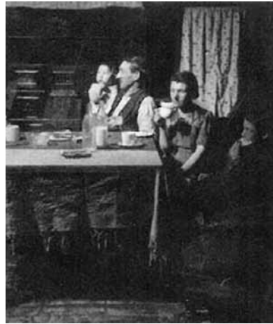
Figure 7: Commissioned works for Bournville Village Trust, 1939–1941.

seven engravings by Gustave Doré made in the 1870s. 40) One of these engravings was used in a similar juxtaposition with a photograph by Brandt in Changing Britain: The