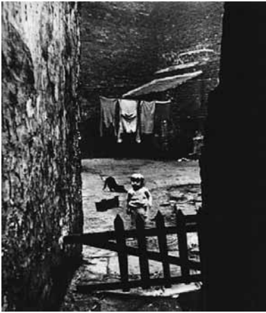
Figure 3-1: 'A Sheffield Back-Yard', 1937.