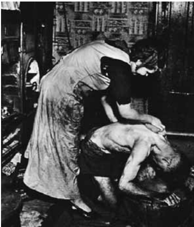
Figure 3-3: 'East Durham Coal-Miner Just Home from the Pit', 1937.