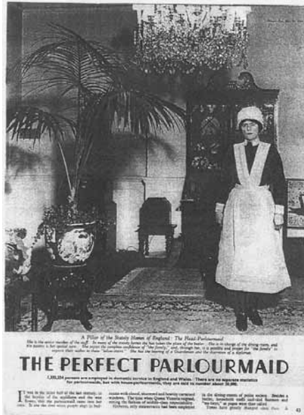
Figure 6-1 to 6-3: Picture Post , 'The Perfect Parlourmaid', July 29, 1939: 43-47.