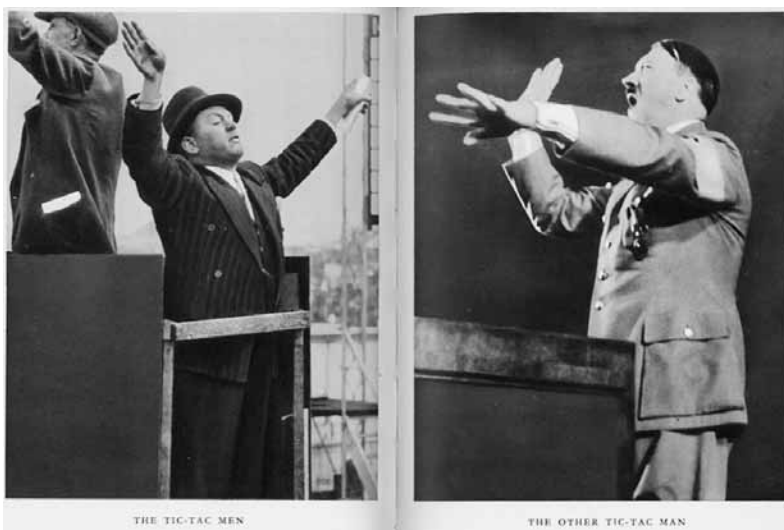
Figure 2: Lilliput , ‘The Tic-Tac Men’ and ‘The Chancellor of Germany’, March 1938: 244–245.