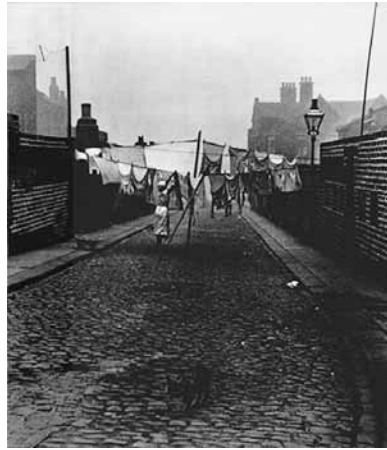
Figure 3-2: 'Back Street in Jarrow, Tyneside', 1937.