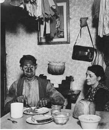
Figure 4-1: 'Northumbrian Miner at His Evening Meal', 1937.