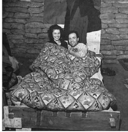
Figure 4-2: 'West End Shop Basement Shelter', November 7, 1940.

searcher photograph; that is, we cannot discount the possibility of Vadas' photo as a prototype for Brandt's coal searcher. Brandt possibly constructed this image in order to emphasise the severe living conditions of the Northern working class.