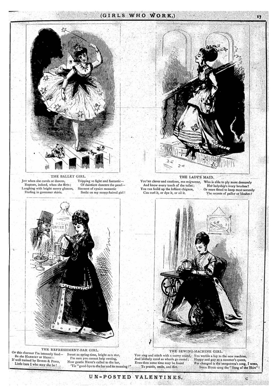
Figure 2 – Girls Who Work