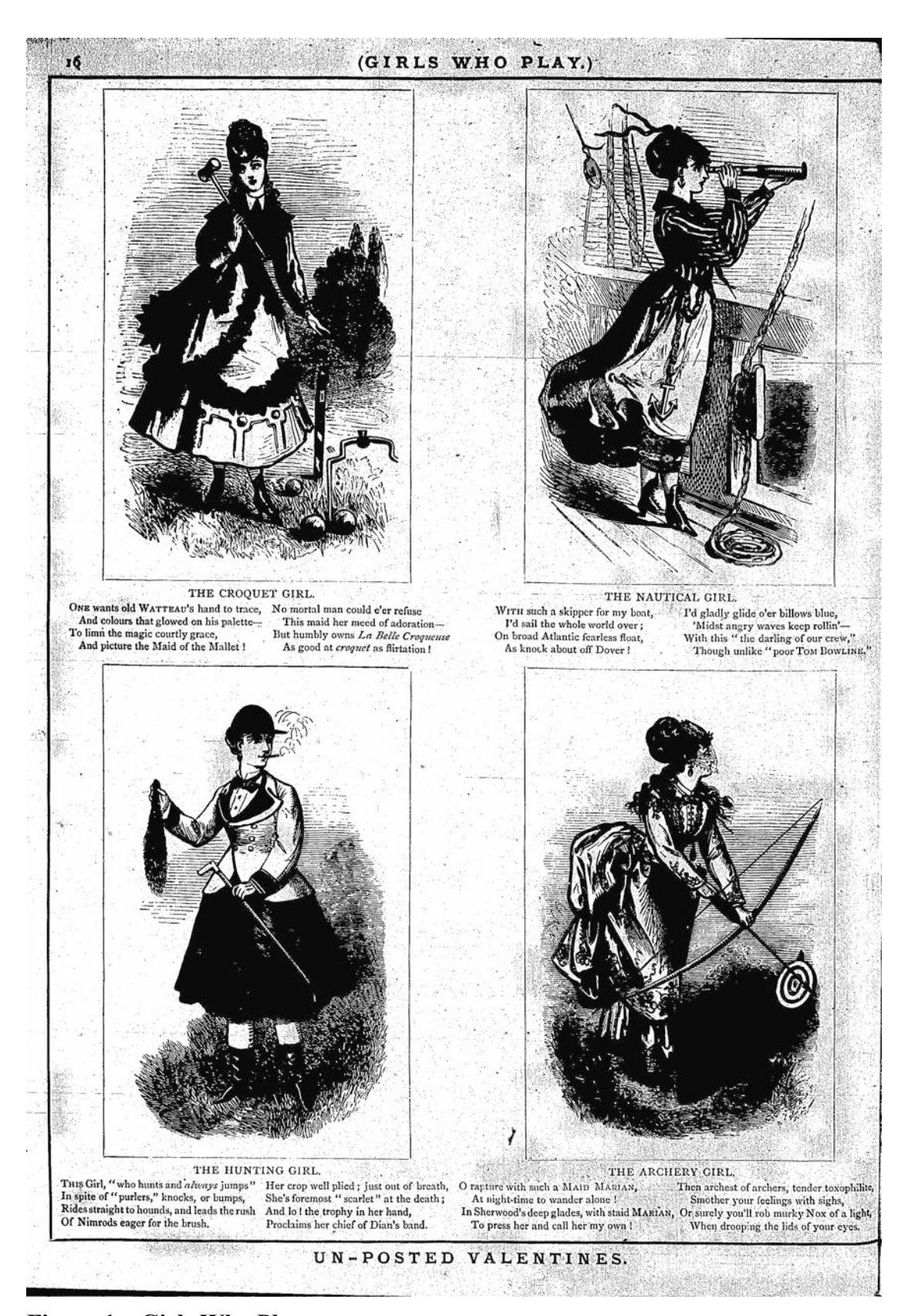
Figure 1 – Girls Who Play