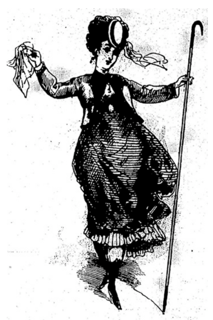
Figure 6 – The Climbing Girl

girls and girlhood in the last three decades of the nineteenth century. Her popularity demonstrates the extent to which she captivates the imaginations of the public. Importantly, however, even as the Miscellany redefines Linton's homogenous Girl of the Period into a series of figures who are appreciated for their wit, daring, and adventure, the magazine is careful to ensure that it keeps the core of the mid-Victorian feminine ideal intact. The many Girls of the Period figured in the magazine could cross most of the boundaries established for them, but their sexual and moral purity is sacrosanct.