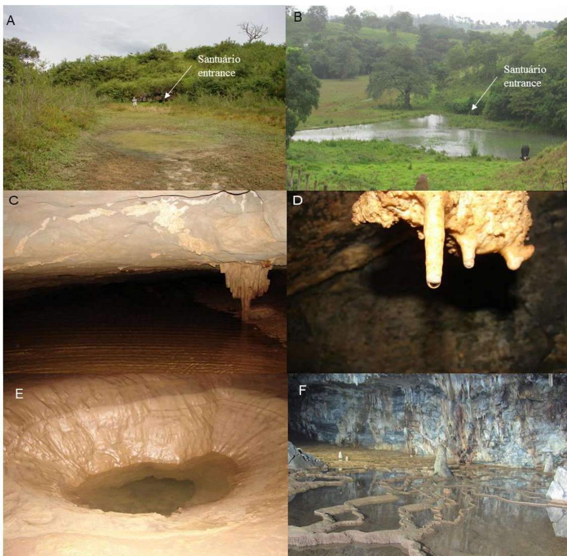
Figure 4. Exo and endokarstic features in two limestone caves in Brazil. Temporary epigean pond near the Santuário cave entrance (A and B), temporary hypogean pond in the Santuário cave (C), Water that percolates through exokarst/epikarst and drips from speleothems (D), groundwater (E) and travertines in the Brega cave (F).

Close to the entrance of Santuário cave the rainwater accumulates in temporary epigean ponds and flows through the cave in runoffs or filtered by the soil (Figure 4 A and C). In the runoff clay, trunks, leaves and bovine feces are transported in small amounts.