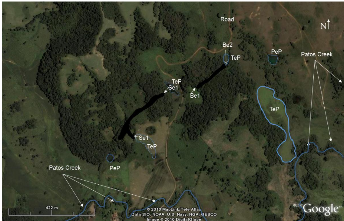
Figure 2. Representation of karstic features that promote water dynamics in the surroundings and inside the Brega and Santuário caves. Brega entrance (Be), Santuário entrance (Se), Temporary epigeian pond (TeP), Permanent epigeian pond (PeP).