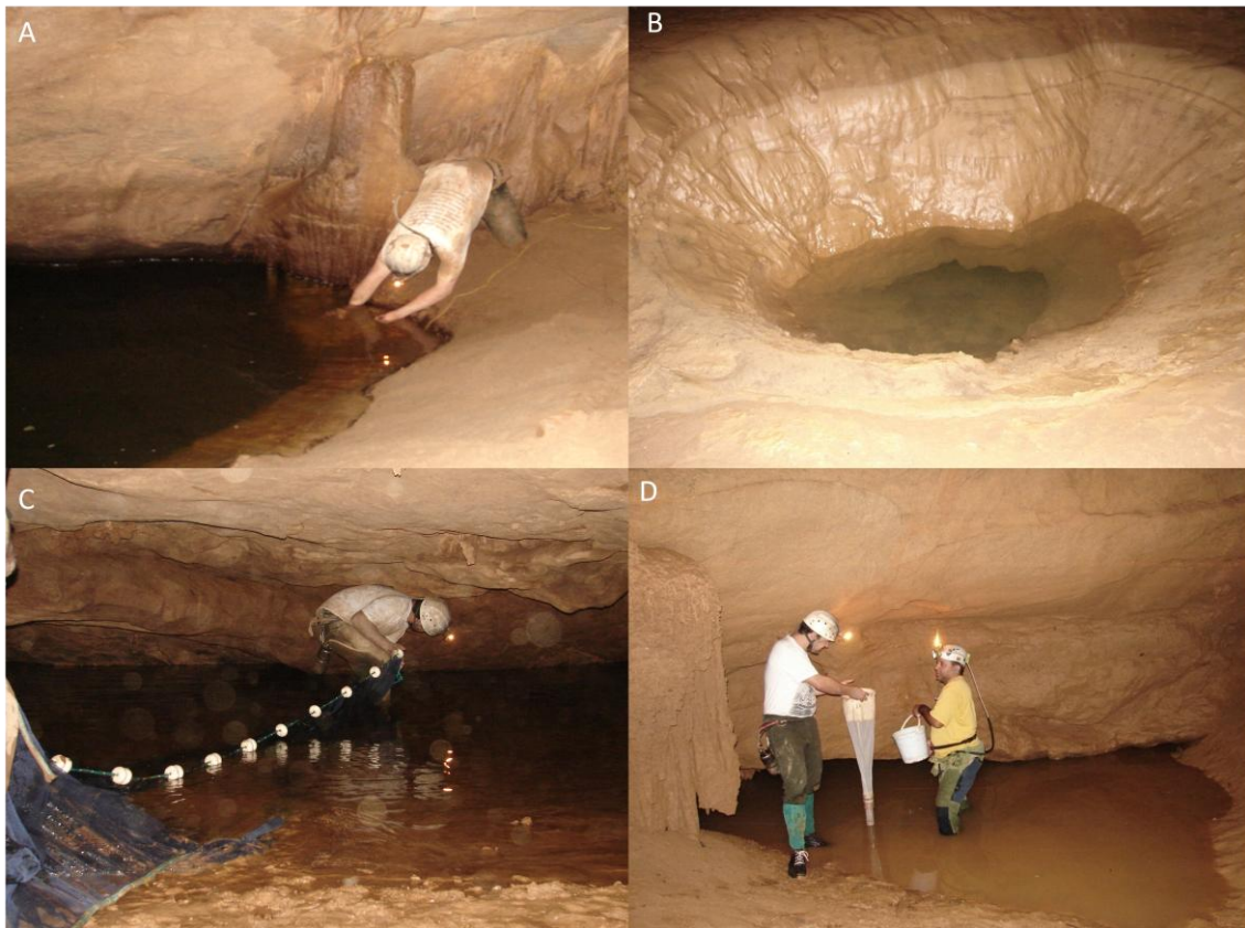
Figure 3. Groundwater of the Santuário cave (A); Point 1 Santuário Cave (B); Ichthyofauna collection with drag net in the Santuário cave (C), Collection of zooplankton with bucket and net in the Brega cave (D).

For the zooplankton collection, 100 liters of water were filtered per collection station during each collection. The collection was made with using a 5 liter bucket and filtering carried out in a 120 \mu m mesh zooplankton net. After filtering, the material was stored in polyethylene flasks and properly labeled, stained with rose bengal dye and preserved with 4% formaldehyde after a period of 15 minutes, still in situ . The collected organisms were identified in the laboratory and counted under a microscope.