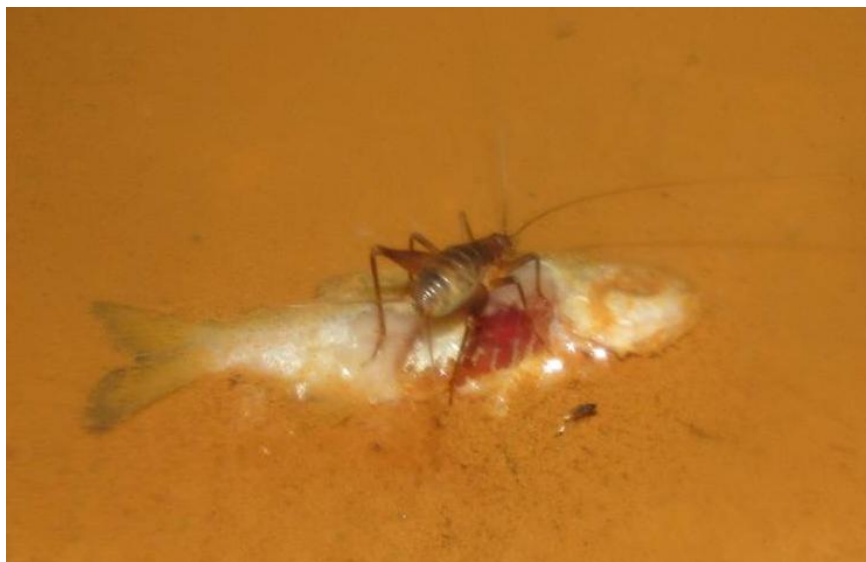
Figure 6. Terrestrial Phalangopsidae ( Endecous sp.) feeding on Characiformes carcass ( Astyanax sp.) in Santuário cave.