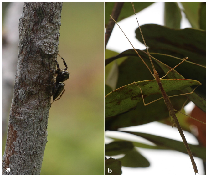
Figure 3. Evidence of direct associations between insects and the flower of X. novoguineensis . A photographed source in parentheses (a). Spider on the trunk (R.C. Sanito). (b) Stick insect on the leaves (R.C. Sanito).

Based on the exploration result, some insects were found on the several parts of X. novoguineensis . In this context, stick insects, from