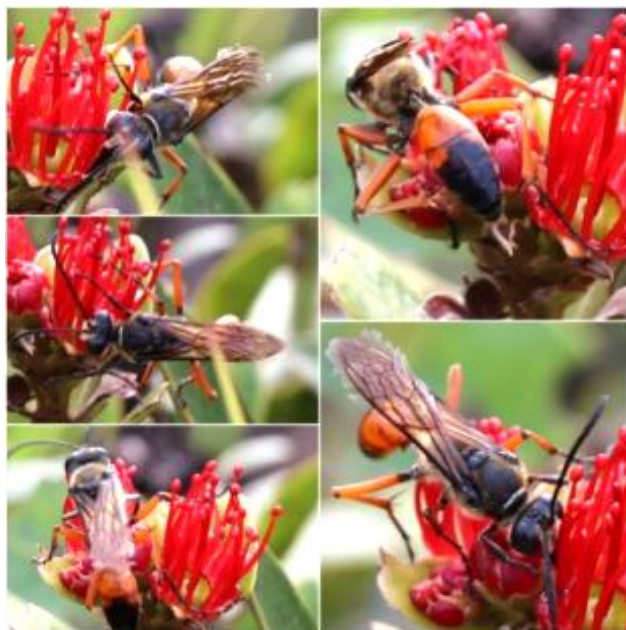
Figure 2. Movement of black-orange wasp in the absorption of nectar at the X. novoguineensis flowers. The images based on various angles and positions.

black wasp and orange wasp were attracted by the flower of X. novoguineensis (fig 2). This wasp visited the flowers of this plant regularly.