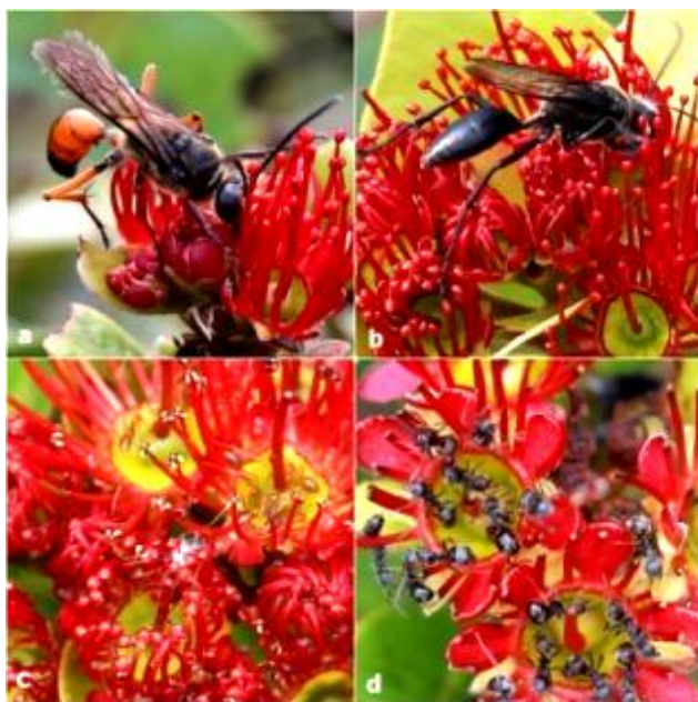
Figure 1. Evidence of an association directly between insects and the flower of X. novoguineensis (a) & (b) the documentation of wasp that absorb the nectar at the flower of X. novoguineensis . (c) red ants, (d) black ants.