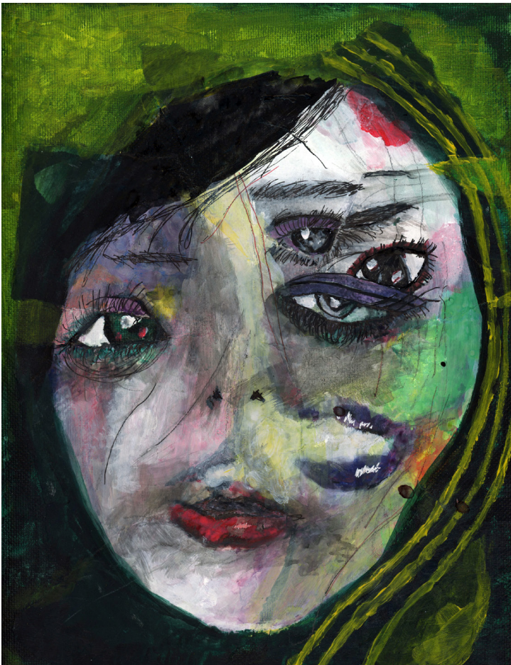
EVA IN GREEN

This series of artwork was inspired by an artist named Takahiro Kimura's Broken 1000 Faces project. I took people's photographs then ripped them apart before piecing them back together misaligned from their original positions. Then I painted over their portraits with an emphasis on color, tone, and composition rather than an emphasis on their expression. A person's expression captured on a camera captures them in that moment, precisely one moment. A moment does not represent a person in their entirety because a person is fluid, not static like their picture. A camera captures what can be seen on the surface of the subject, not what is beneath. Thus, I chose to work on what can be seen without fluffing about what's underneath.