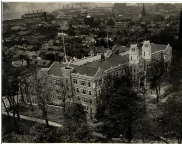
Completed Packard Laboratory in 1929 with Bethlehem Steel in the background