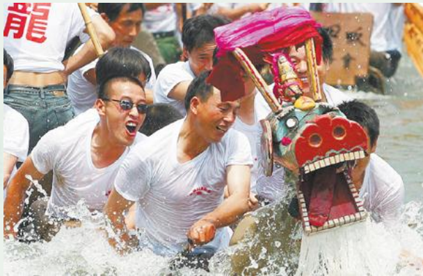
Dragon boat ceremony