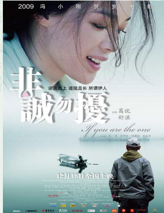
《If You Are the One》