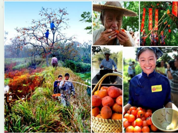
Persimmon and plum festival