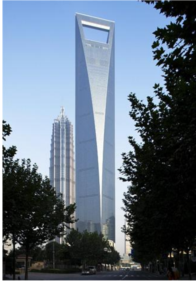
Shanghai World Financial Center 492 m