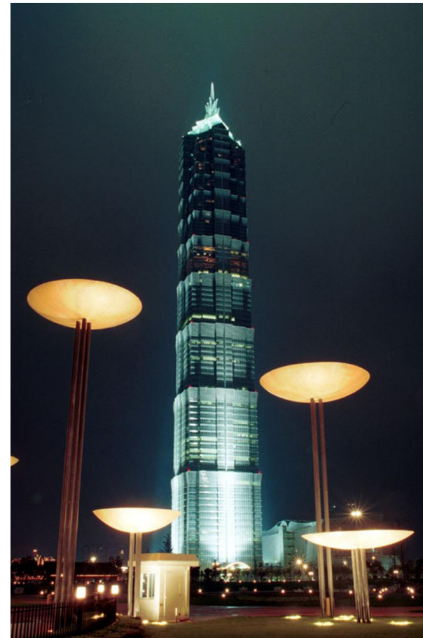
Shanghai Jinmao Tower 420 m