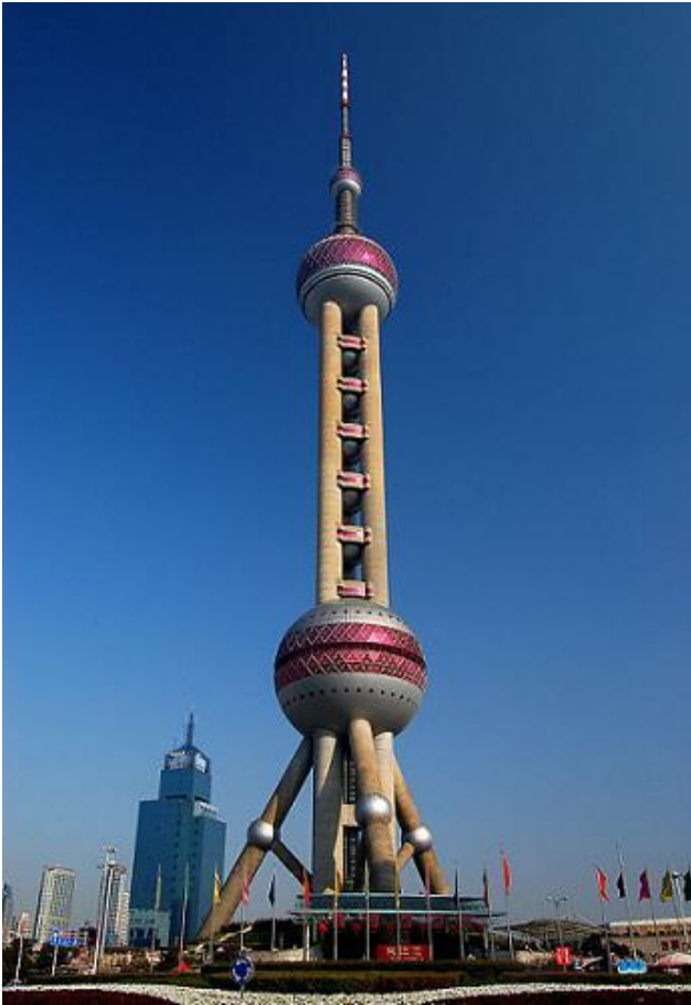
Oriental Pearl 468 m