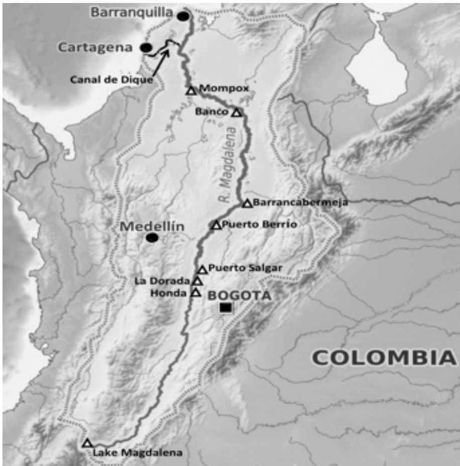
Figure 1 The Magdalena River Basin