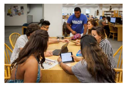
iBooks Catalog Expanding