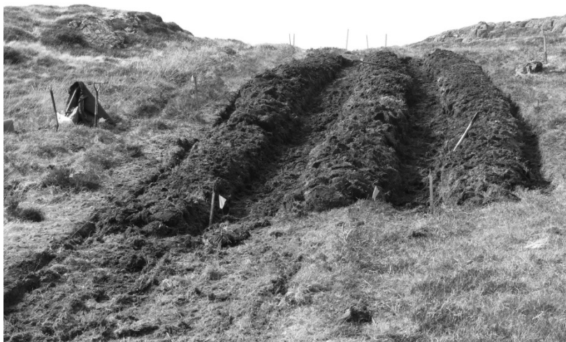
Figure 2. Photographs of two of the research team (S. Warnick and T-J Marsden) re-establishing the ridges with the use of spades (top). The 3 established and manured ridges on Grimsay with the uncultivated ridge to their left (bottom).