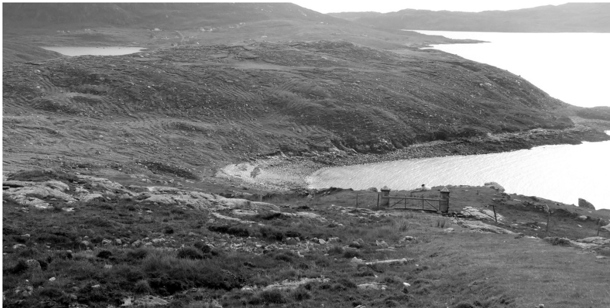
Figure 1 Extensive evidence of an abandoned ridge system on the West coast of Lewis near Huisinis.