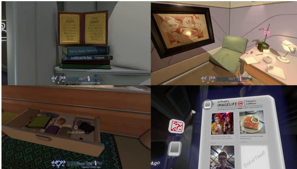
Figure 5. Clockwise from top left ( Tacoma ): Personal library of Sareh exposing an excerpt of the Quran, as well as books about anxiety and emotions. Reading and writing space around a poem. Web-based activities showing JJ Pratt’s profile. Personal drawer under the bed full of mundane stuff.

All those realistic traces of Sareh’s intimacy make more sense when players connect them later with indexes in her work environment. In her office, a confidential email from her employer, Venturis Corporation, mentions that better job options would be offered if Sareh “accept[s] personal responsibility for the incident of September 2, 2085 upon the Foundation of Paradise” ( Tacoma ). Furthermore, a diary note near anti-anxiety pills reveals that Sareh is engaged in a therapeutic process to cure some form of guilt (a narrative clue that resonates with a panic attack she had in the botanic area). Under the notepad, there is a key to a nearby locker. Once it is unlocked by Amy, she finds a newspaper article about JJ Pratt’s death during an AI-assisted surgery executed by Sareh. While the doctor argues that the incident is due to the “faulty judgment of Venturis’ Medical AI, HEKA,” Venturis “admitted no wrongdoing in the death of Mr Pratt” ( Tacoma ).