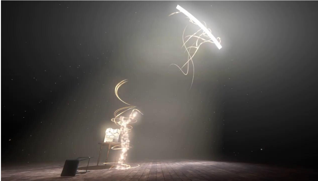
Figure 8. Re-enactment of Kate's rapture by the cosmic entity in EGTTT .

EGTTT plays with the first-person player-character's ambiguous sense of (dis)embodiment observable in many walking simulators—that of a diegetic ghost, a first-person external observer, or a pure consciousness that has no power to affect the course of events—to cultivate an intriguing ludonarrative aporia. Players were literally put in the role of a metaphysical consciousness from which they had to interpret the past more from their own subjectivity and social self than from their character's perspective. Other games like Proteus , Scanner Sombre , and The Novelist are perfect examples of this cluster, since they put players in the fictional role of a ghost or disembodied consciousness from which they are invited to personally engage with social realism. This cluster therefore becomes a gateway for generic effects along the line of Zen-like mindfulness, self-affirmation, self-realization, and self-reflexivity. The result is a generic experience that is keen to open paths of interrogation and interpretation where players are encouraged to self-consciously meditate and question their own existence, belief system, moral code, and social reality.