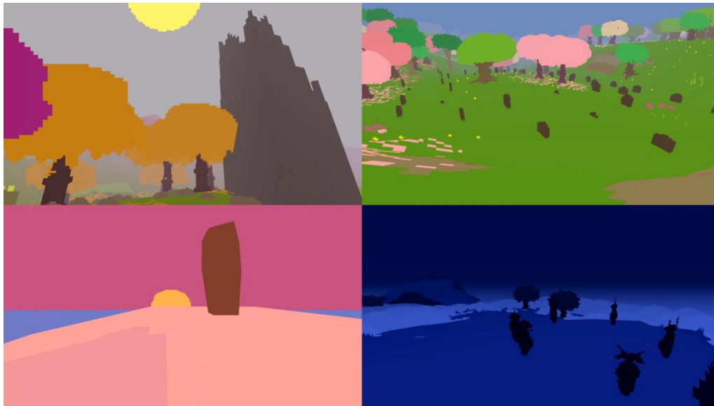
Figure 2. Clockwise from top left ( Proteus ): Unexplained ruins. Strange cemetery in the middle of the inhabited island. Circle of alien-like statues during the mystical ascension at the end of the game. Mysterious stone at the summit of a hill.

Something else greets them on arrival: a strange but symphonious concert. This concert is responsive to spatial movement with an indeterminate arrangement of layers of sound effects and repeated sonic patterns, fading in and out, pitching high and low, that is reminiscent of generative and serial music. Every visual element on the island has its own audible quality, even the different types of terrain. Players are thus encouraged to hunt down new musical arrangements to contemplate. In this regard, Proteus could be described as an acoustic safari, in which players locate new sounds, modulate them, listen to them evolving over time, and take off for another excursion. Sooner or later, players stumble upon particles floating in the air that guide them into a circle of strange statues. Standing there at night makes the current season pass at an accelerated speed, evocative of a macro-scale time-lapse that foregrounds the notion of a cyclical cosmic time to which all life forms are subjected. This ritual can be accomplished three times, passing from spring to summer, autumn, and winter, until the final mystical elevation of the player-character accompanied with chanting mantras in the background.