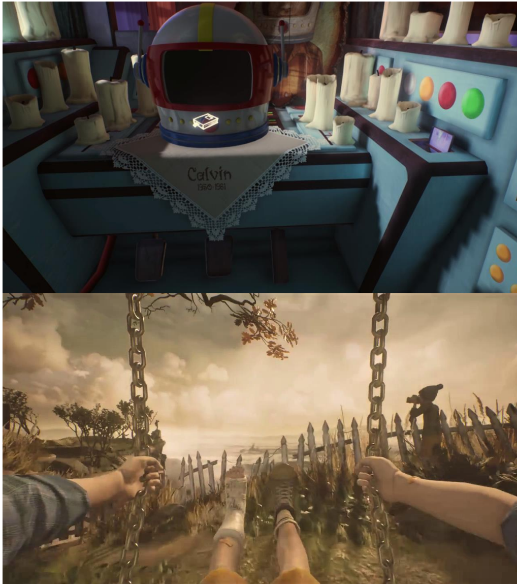
Figure 4. Top: A monument to Calvin in his childhood room in WROEF . Bottom: Re-enactment of Calvin's death in front of the cliff where he will fall.

back and forth with both joysticks to gain momentum and reach greater heights, Sam speculates whether Calvin would not be dead if he did not challenge him to do it or if the wind did not pick up. Despite suspecting what is coming, players have to overcome their discomfort and keep swinging. At a certain speed, Calvin rotates fully on the swing and is launched over the cliff. The scene fades to white, concealing what happens next.