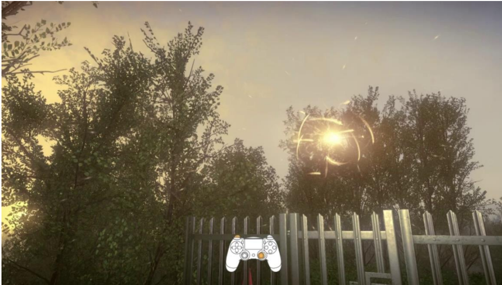
Figure 7. Disembodied execution of a sound puzzle in EGTTT .

conversations as if the player was not there. The abstract manipulation of the orb and the disembodied apprehension of the flashback fragments create a strong sense of distancing that makes room for players' subjectivity to settle in as a first-person external observer.