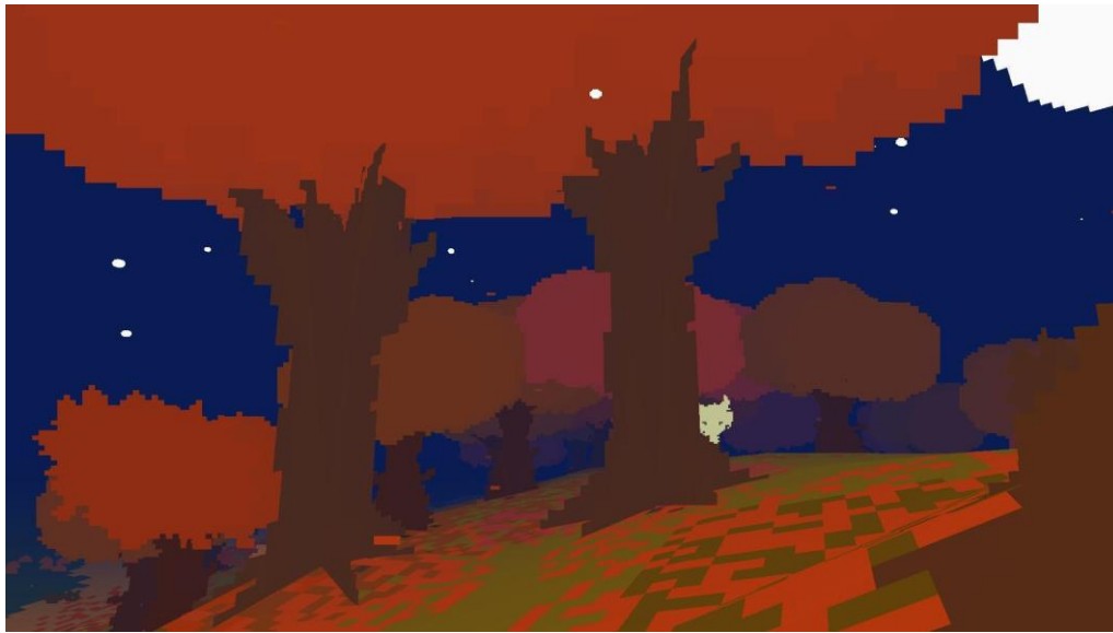
Figure 3. The spectral wolf of Proteus appearing near the sole big tree of the island during autumn nights.

autumn summons the spectral wolf who, hiding behind vegetation, only shows its face, disappearing and reappearing here and there (Figure 3).