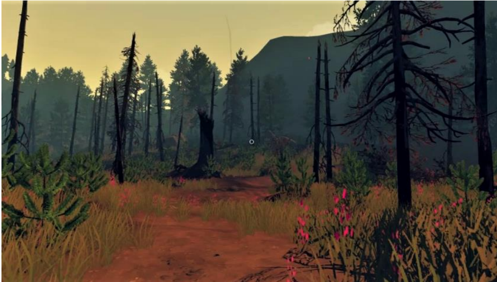
Figure 1. Henry, the first-person character of Firewatch , facing the burned part of the park with the thought of his wife he recently abandoned.

This codification of space culminates at the end of the game, when it is revealed that a previous lookout named Ned has been causing trouble in the park. In an effort to stay hidden in the woods after witnessing the death of his son in a climbing accident for which he feels responsible, Ned ignites a massive fire to force the evacuation of Henry and Delilah. Ned's situation reflects Henry's guilt and inability to process his trauma regarding his wife's deteriorating condition. In light of codified space, the negotiation of the spatio-narrative obstacles created by Ned (the cutting of climbing ropes and communication lines, the locked gate blocking access to his son's body inside a sinuous cave, deceptive clues spread around the park, the proliferation of inextinguishable fires, etc.) directly mirror Henry's internal struggle. In a last conversation through walkie-talkie, Henry and Delilah recognize they both have inner demons and agree to face them instead of running away (and acting like Ned). Following this exchange, Henry accepts that he has to go back to his wife and settle his personal issues.