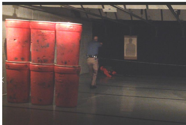
Figure 2. Dynamic scenario.