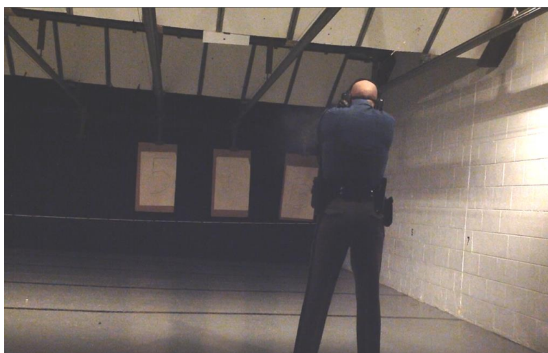
Figure 3. Positive identification task.

Officers wore their standard uniform and duty load throughout all three shooting scenarios to eliminate any variability that load carriage may have on their shooting performance or their physical endurance [18,24,25]. The total score was calculated by adding all three final scores together and dividing the total by three.