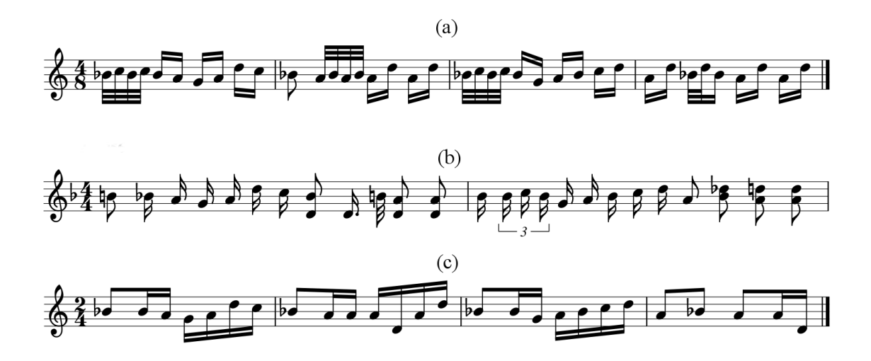
Figure 1 . Transcriptions for bars 85-88 of segment 114 from the corpus of [8]. (a) Reference transcription. (b) Automatic transcription as presented to participant. (c) Manual transcription created by one of the expert participants.