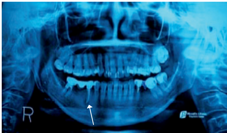
Figure 3. At three month later, the radiographic showed that there was alveolar bone gain (arrow).

However, two years later, the patient reported with chief complaint of pain, swelling, and pus discharge from the right mandibular second premolar. The tooth was previously sensitive, but there was no any pockets persisted around the