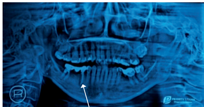
Figure 2. Tooth 45 within a new crown and bridge after endodontic treatment and showed that there was a widening lesion a year forward (arrow).

Two years later, patient reported with a chief complaint about spontaneous pain, swelling, and pus from 45. The