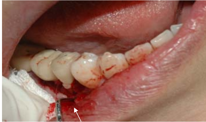
Figure 5. The opening of flap operation on a first management showed that there was a bone defect as a crater (arrow).

tooth. Based on the case and radiography, a periodontist decided to correct the problem by opening flap surgery, and the crater was filled by using bone graft substitute. One week after the surgery, the patient returned and there was asymptomatic. At three month later as showed at the figure 3, patient reported, there was no pain and the radiographic showed that there was alveolar bone gain.