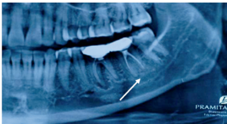
Figure 4. The tooth 36 was diagnosed as an endo-perio lesion. The endodontic treatment showed improper obturation.