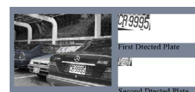
(c) Result of multiple plates in one image