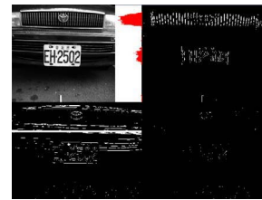
Fig.3 The unusual vertical edge

Because the size of license plate may change by the distance between camera and car we must decide the size of searching mask before finding the candidate region. We note that the vertical edge in HL subimage shows the plate size information and unusual vertical edge. Calculate the horizontal projection of vertical edge in HL subimage. The curve of horizontal projection can be gotten and we examine the curve carefully to get the peaks. Then, the several maximal sets of all peaks denote the possible width of the license plate. Hence, we can decide the proper size of the searching mask according to the width of maxima set.