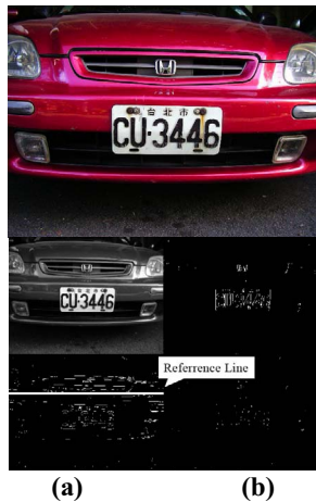
Fig.2 (a) original input image (b) result of Haar wavelet transform and the reference line in LH subimage