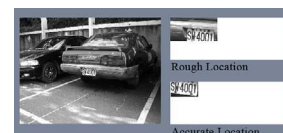
(b) Result of license plate detection when the plate is inclined and smaller