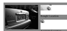
(a) The contrast between the license plates and background is not clear enough