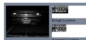
(a) Result of license plate detection in the night

The main idea of the thesis is to realize a system of license plate detection which is effective and fast-calculating. A novel approach for extracting license plate from cluttered scene is presented in this paper. The proposed system consists of three main stages, wavelet transform, roughly extracting candidate regions based on high frequency feature, and locating the exact license plate. The average accuracy of license plate detection is 92.4%. The experimental results show that our method has great effect in application. Therefore, no matter how the captured environment is changed, the desired license plate can be correctly located.