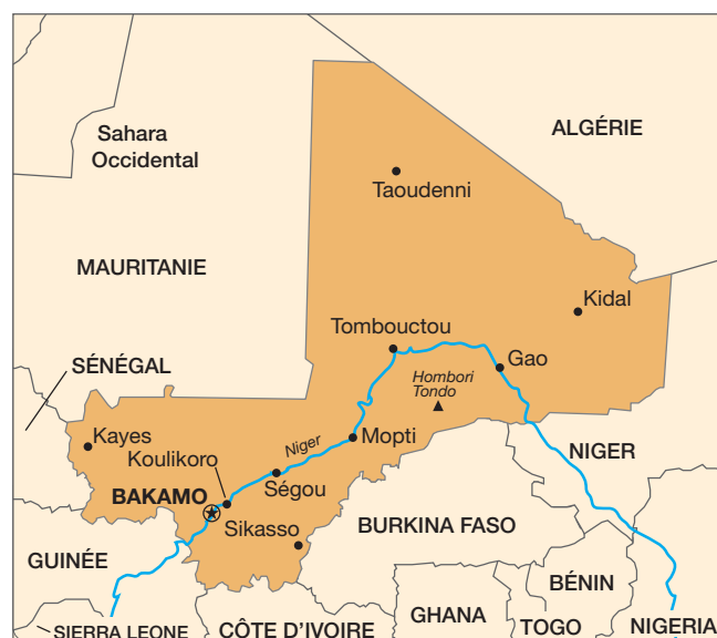
Figure 1. Location on the map.

With a population of 12 million and an estimated prevalence of 1.3% 1 in adults, the number of people infected with HIV/AIDS in the country is estimated at 130,000 and the number of people needing ART at 27,000. Women have a higher prevalence (1.4% versus 0.9% for men) with a peak in the 25–30 age-bracket. Urban prevalence is 1.6% versus 0.9% in rural areas. The city of Bamako has the highest prevalence in the country (1.9%).