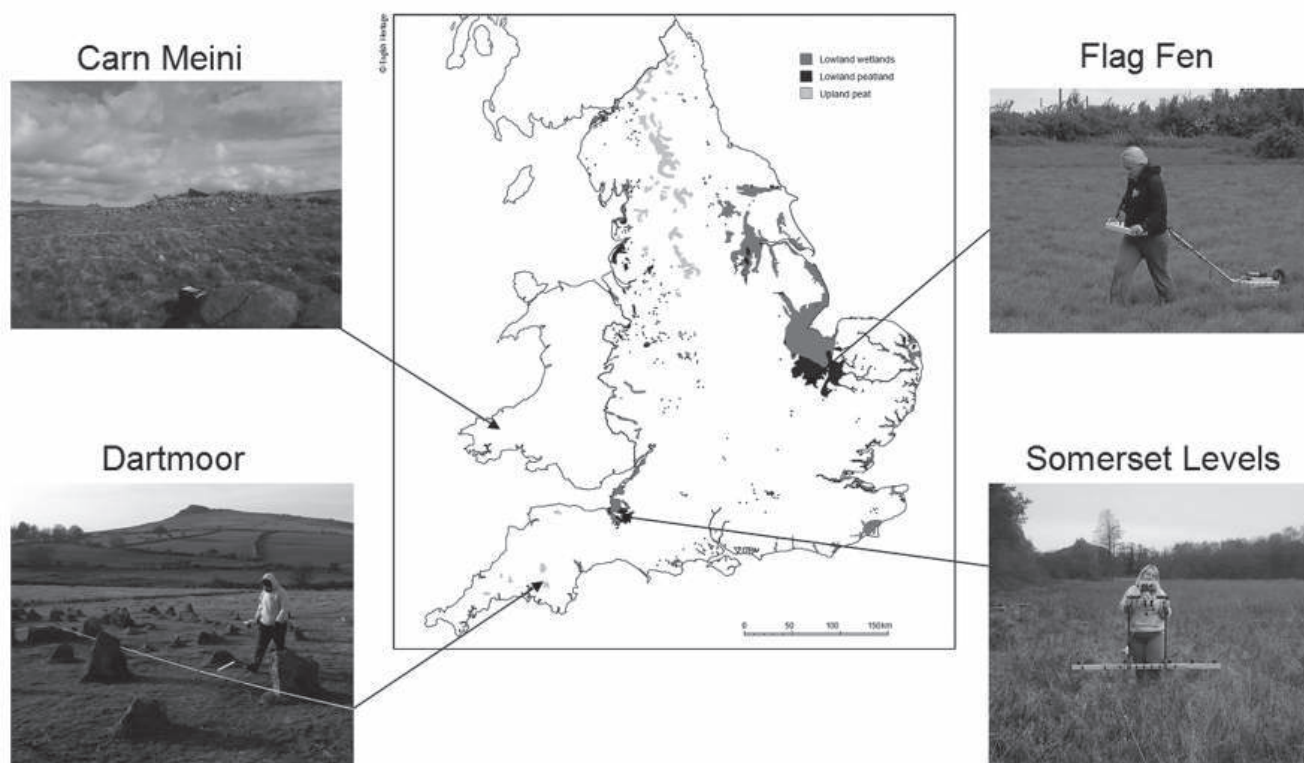
Figure 1: Case Study Locations. Map from Van de Noort et al (2002, 7).

used to compare the survey outcomes and assist in making judgements about the strengths and weaknesses of them in different environments.