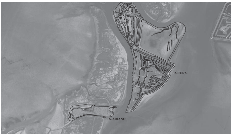
Figure 1: Overview of Constanciacus from the satellite with the surviving islands of La Cura e S. Ariano. GIS elaboration of satellite image and Regional Technical Map.