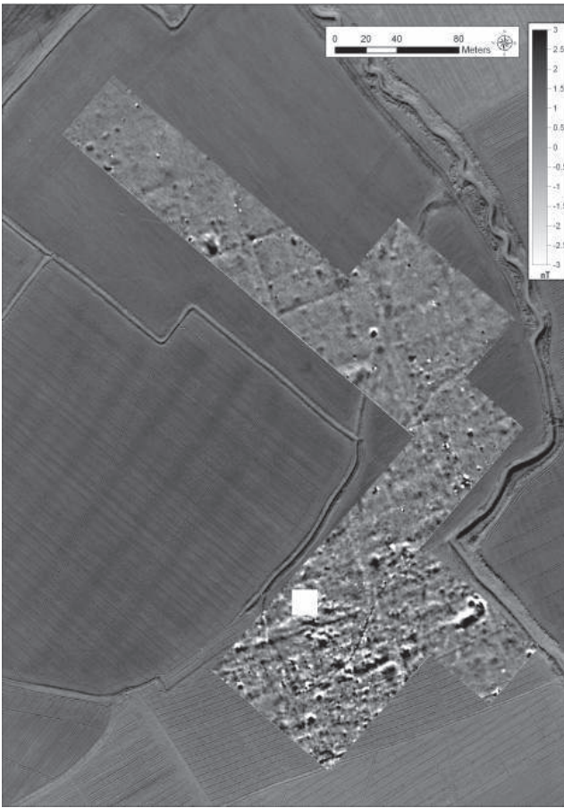
Figure 3: Magnetic gradient map of fields located northwest of the Persepolis Royal Terrace.

we have also observed some very limited traces of small rectangular anomalies, possibly related to buried remains of buildings. These shapes are integrated with the orientation of the general grid of long linear anomalies described above. In conclusion, this grid can be said to correspond to ancient landscape planning, possibly dating back to Achaemenid times and perhaps including both agricultural and garden areas within one considered plan.