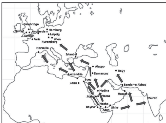
Figure 1. Diffusion of Coffee in the World

The first coffee house in England opened in Oxford in 1650. London soon followed suit. In France, coffee houses appeared in Marseille around 1671, and in Paris after that. The coffee-drinking culture soon made its way to other European cities such as Amsterdam, Vienna, Nuremberg, Hamburg, and Leipzig [Ukers 2007: 20–100]. Coffee thus diffused throughout Europe in only half a century, from the middle of the seventeenth century, even though the production of coffee was restricted to Ethiopia and Yemen.