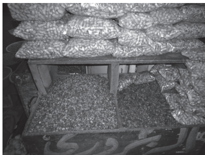
Figure 6. A Coffee Beans Shop in Yemen (Left : Roasted Husks [ qishr ], Right: Roasted Kernels [ bunn ])