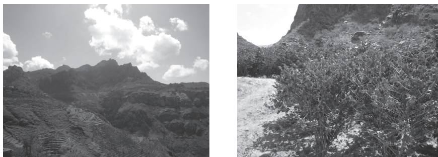
Figure 3. A Coffee Plantation in Yemen

Though Niebuhr's visit to Yemen was in the eighteenth century, his account tells us that there was a kind of irrigation system in place. He also reports that the local people there were more accustomed to European people than anywhere else in Yemen, but were a little suspicious of the members of his expedition because they did not seem to be European merchants wanting to trade in the area [Niebuhr 1994: 294–295]. This testifies to the presence of European merchants in the interior of Yemen to purchase coffee. However, usually the coffee beans cultivated there were bought by middlemen, such as Arab or Indian merchants, then taken to Bayt al-Faqīh, a market trading in the coffee produced in the highlands, from which it was exported by both land and sea.