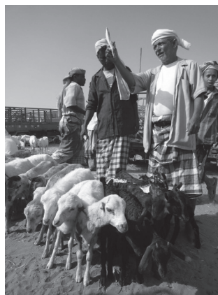
Figure 4. Bayt al-Faqīh