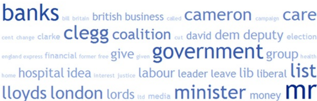
Figure 3 – Tag cloud for news articles prior to the Liberal Democrat conference

That said, I would be cautious about assuming all the coverage of the Liberal Democrats is bad news. Using the same search criteria, I pulled up newspaper articles for the week before the conference and put them in a tag cloud (Figure 3). Of course, without a proper comparison, we have no way of knowing if this is a typical week, but the words that I had expected to see – maybe “unpopular”, “disliked” etc – were not there. Instead, there is a picture painted of Clegg being at the heart of government and being written about as important to the various policy debates that are on-going.