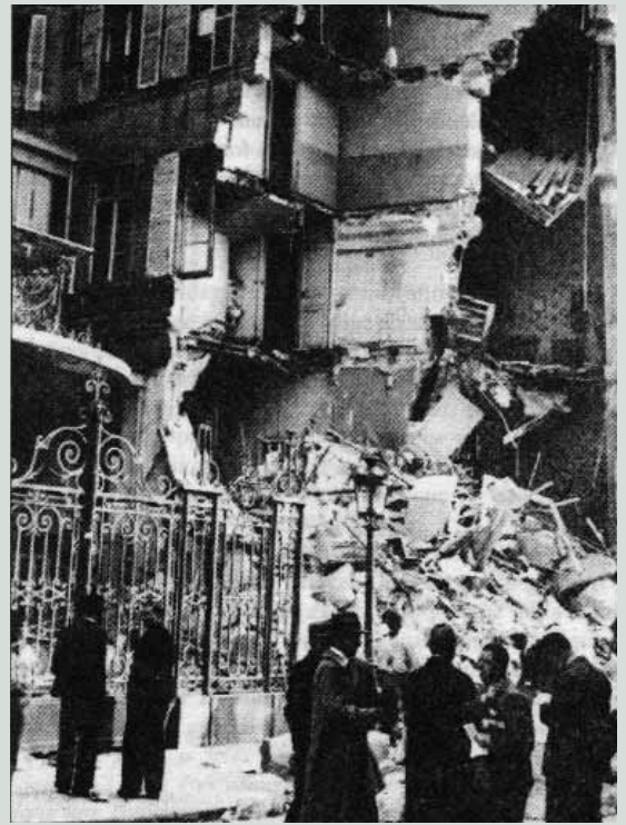
Scene of the Cagoule bombing of Sept. 11, 1937