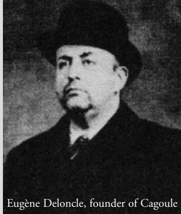
Eugène Deloncle, founder of Cagoule