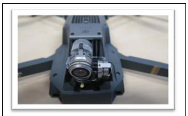
(a) UAV with a camera (HD camera fitted to a DJI Mavic Pro).

Thus, identifying such modifications will help support an investigation to either confirm or refute the alleged use during the offence. An example could be the sending of items into a restricted area (e.g. prison). Most standard drones do not have a load carrying mechanism. Due to flight time restrictions, the drone may have a non- standard battery (to increase flight time). The drone may also have non-standard motors to reduce noise levels.