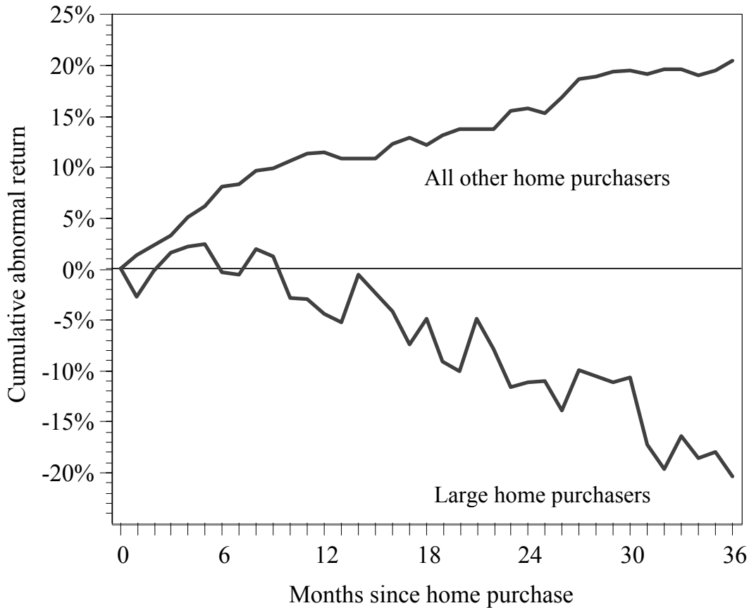
Figure 3 Cumulative abnormal stock returns subsequent to CEOs' home purchases

The graph shows the cumulative abnormal stock performance for a sample of 165 S&P 500 companies in which the CEO acquired his home subsequent to his appointment as CEO. The large home subsample, which includes 25 observations, features residences of at least 10,000 square feet or land area of at least 10 acres. CEOs' addresses and home characteristics are obtained from searches of Internet residential real estate records. Abnormal stock returns are calculated on a monthly basis as the difference between the raw stock return and the return on the S&P 500 index, both compounded continuously.