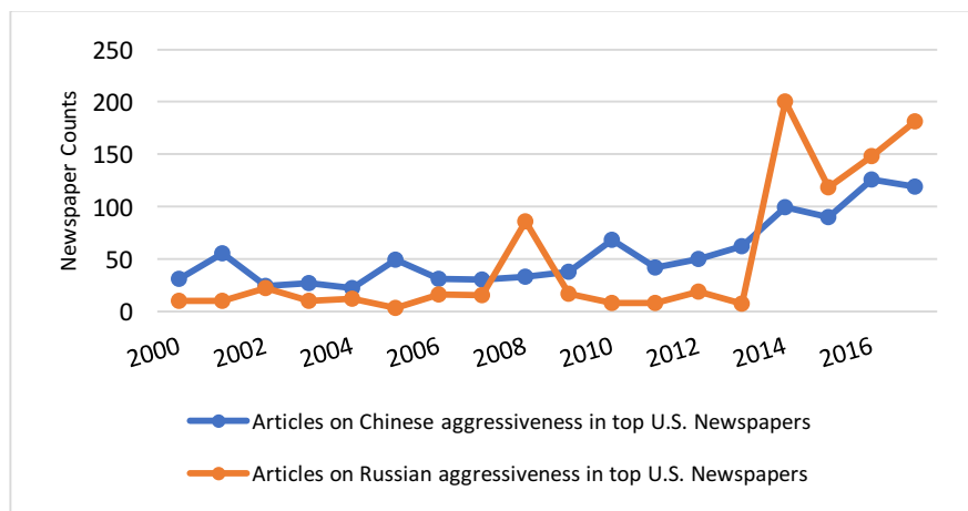
Figure 1. Keyword Search on Chinese and Russian Aggressiveness in Eight Major U.S. Newspapers.

U.S. analysts, policymakers and naval officers have demonstrated a level of alarm that approximates paranoia towards China and Russia. An Atlantic article published in 2015 demonstrates the rapid rise of the “assertive narrative” in U.S. media. 6 Replicating the method used in the article, I ran a search in eight major U.S. newspaper publications for “China” or “Russia” and “aggressive” or “aggression” within five words of each other, 7 and the following graph is the trend line that I traced. Undoubtedly, U.S. media has exponentially increased the usage of phrases such as “aggressive” to describe Chinese and Russian foreign policy behaviors, military or diplomatic.