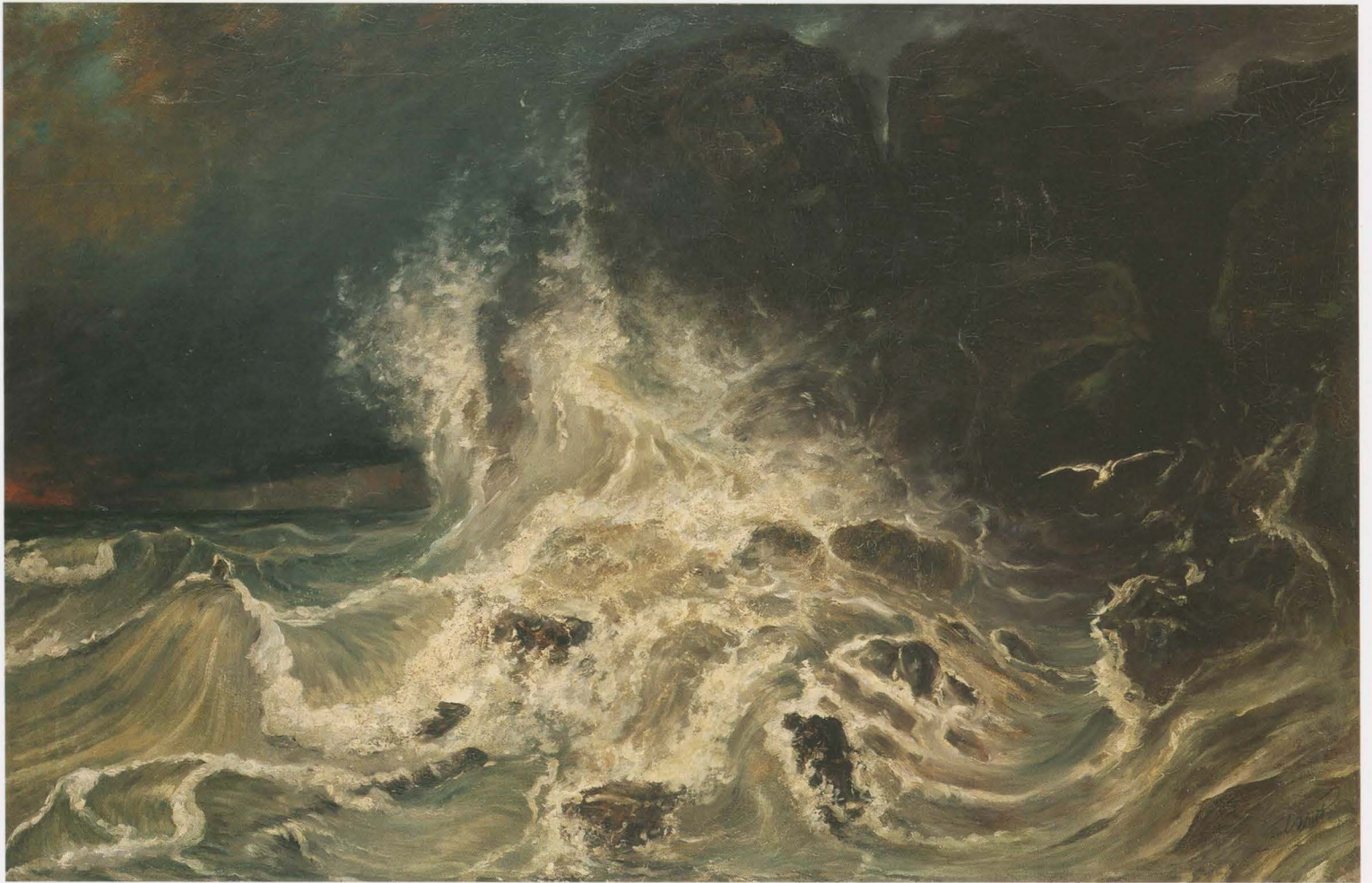
PLATE 8 Paul Huet Breakers at Granville Point 1853 Oil on canvas 26¾ × 40½ inches (68 × 103 cm) Musée du Louvre, Paris. RF 1064 AIC, PMA

Delacroix's friend and fellow Romantic painter Paul Huet (1803–1869) also produced numerous marines. Like Delacroix, Huet had been exhibiting in the official Salon since the 1820s but made his living by selling small-scale works to private collectors. Whereas Delacroix was influenced primarily by the human excesses expressed in Géricault's work, Huet was a quieter, more intimate painter whose landscapes derived from Dutch models by way of Georges Michel (1763–1843), an early painter of the landscapes of France. Both Huet and Delacroix were also acquainted with Richard Parkes Bonington (1801–1828), a British watercolorist who introduced them to the seascapes of Constable and Turner. Huet practiced both landscape and marine painting throughout his career, but his most famous marines were produced during the Second Empire. Breakers at Granville Point (plate 8), exhibited at the Salon of 1853, is a somber and moody representation of France's seacoast. Gray tones predominate in this somewhat gloomy composition, providing a viewer with the chilly sensation of being on the coast on a stormy winter evening. Though the picture is localized both by its title and by its depiction of the half-light of the Normandy coast in winter, the sea is here presented as a universal force of nature whose power cannot be contained even by the distant cliffs. In Huet's composition, the immediacy of the particular visual experience is more important than the clear delineation of landscape forms.