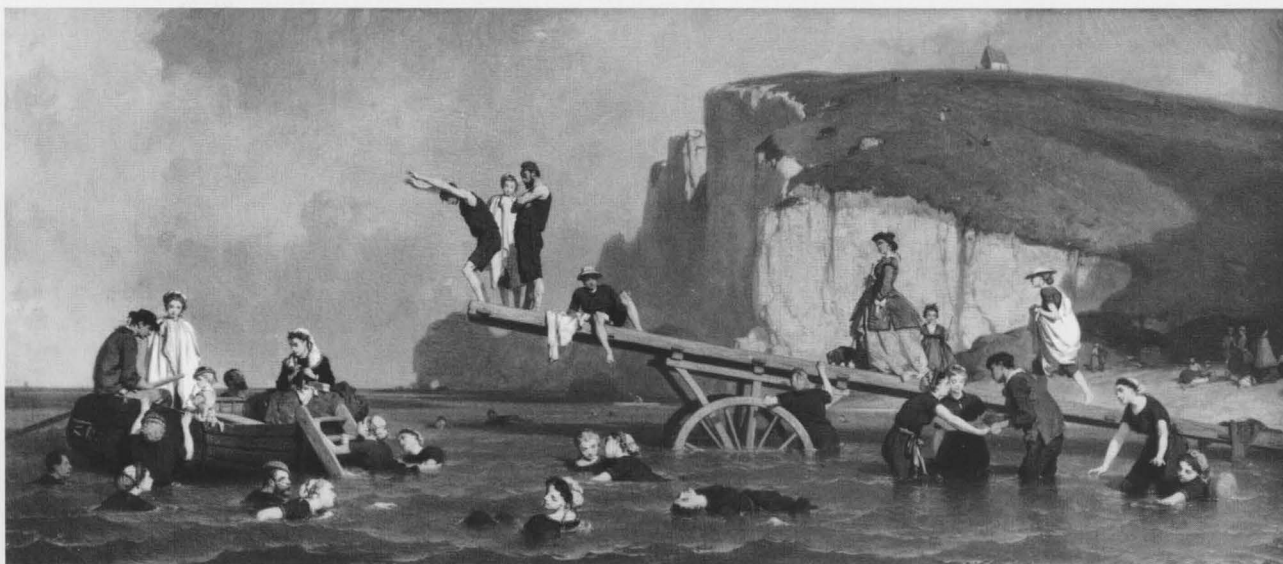
Fig. 16. Eugène Lepoittevin, Bathing at Etretat , 1865–66. Oil on canvas, 8¼ × 19⅞ inches (21 × 48.5 cm). Musée des Beaux-Arts, Troyes. 898.2.3

The erosion of clear genres of painting and the democratization of Salon judging are both examples of the changing terms of contemporary art in France in the 1860s. Previous