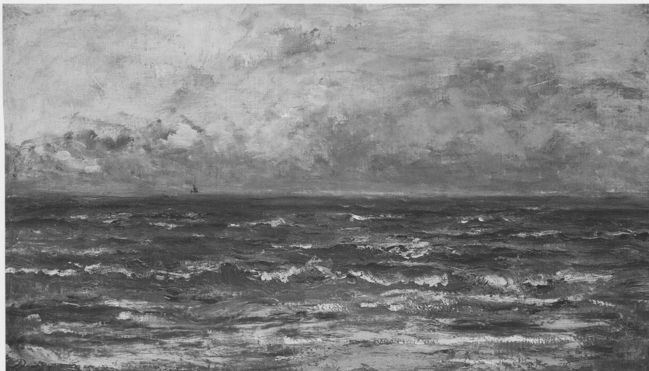
Fig. 15. Charles-François Daubigny, The Sea , c. 1858–65. Oil on canvas, 18½ × 31½ inches (47 × 82 cm). Private collection