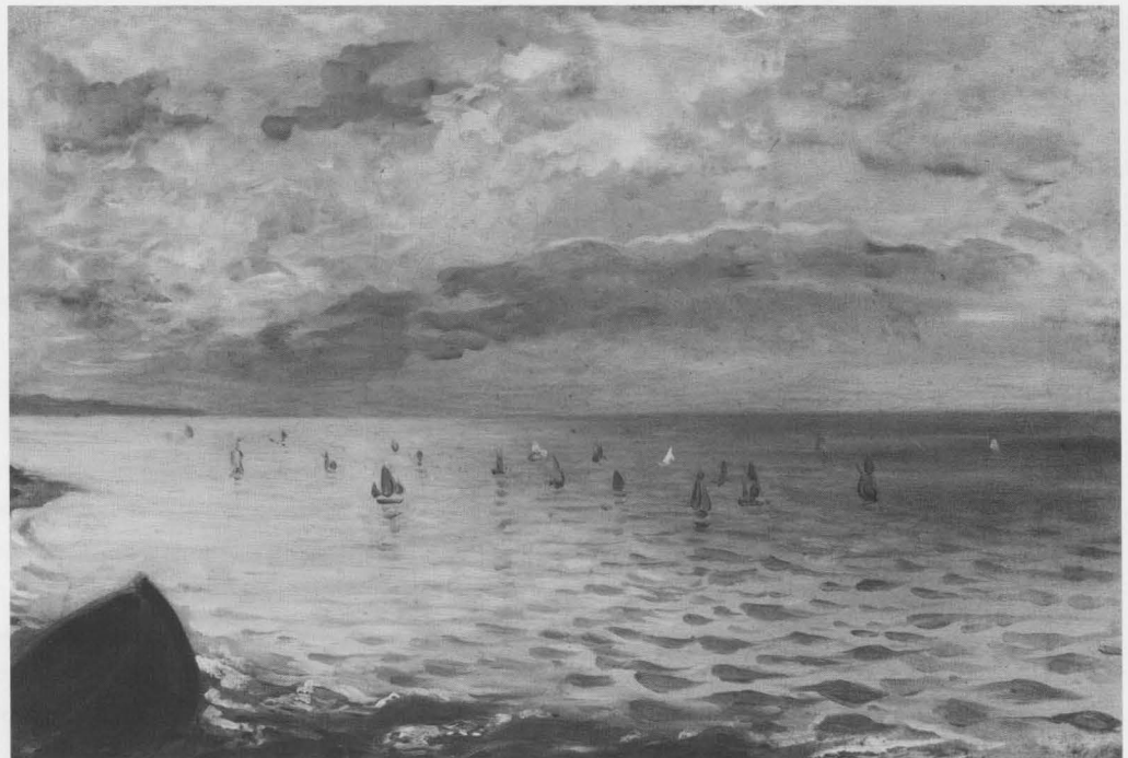
Fig. 12. Eugène Delacroix, The Sea at Dieppe , 1853. Oil on panel, 13\frac{1}{4} \times 20\frac{1}{16} inches (35 × 51 cm). Musée du Louvre, Paris. RF 1979-46

One such painting is Delacroix's Shipwreck on the Coast of 1862 (plate 7), which is in many ways emblematic of Romantic seascapes. It is a scene that pairs a representation of the sea with a human drama, in this case the wreck of a small boat. The viewer peers out at a choppy sea through the rocky grotto that forms a frame within the frame. While it is a late work, it is similar to his earlier seascapes in its sense of motion and drama, implicitly connected to the tumultuous sea. Shipwreck also benefits from Delacroix's firsthand study of the sea in the immediacy of the touch and the luminous sensation the work produces. In a series of pastel and watercolor studies, culminating in The Sea at Dieppe of 1853 (fig. 12), an oil study rendered on panel, Delacroix took on the challenge of representing the immensity and emptiness of the sea with a freshness and immediacy that suggest plein-air painting. In this non-narrative work he employed a high horizon line and rhythmic brushstrokes to communicate the movement of the waves, technical innovations that lead the viewer to contemplate the sea as a subject in itself, free from human dramas or naval battles that take place on its surface.