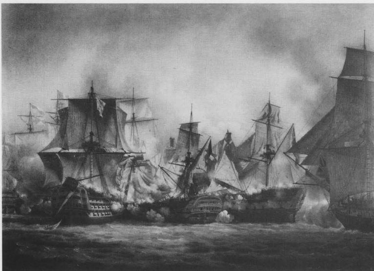
Fig. 10. Louis-Philippe Crépin, "The Redoubtable" at the Battle of Trafalgar , 1805. Oil on canvas, 41¾ × 57¼ inches (105 × 145 cm). Musée de la Marine, Paris

French marine painting arguably reached its peak in the eighteenth century with Claude-Joseph Vernet's Ports of France series of 1753–65. 2 Through this royal commission, Vernet (1714–1789) brought the seaside to central France. One goal of the series was to unify the country by representing its outer limits. While the ports signified France's boundaries, they also symbolized its connection to the outside world through maritime trade, which increased considerably in the eighteenth century. Vernet's Entrance to the Port of Marseilles of 1754 (fig. 9), for example, depicts a panoramic view of the Bay of Marseilles including both maritime activities and social life. Unlike his more idealized marine pictures of storm-tossed seas, shipwrecks, and rustic ports, this topographical view provides a more or less accurate representation of Marseilles at the moment it was painted. The infusion of Mediterranean light and the various groups of pleasure seekers add elements of naturalism to this otherwise highly structured composition. The classical balance of Vernet's composition demonstrates both his academic training and his ability to draw upon the example of Claude Gellée, also known as Claude Lorrain (1600–1682). Considered the prototype