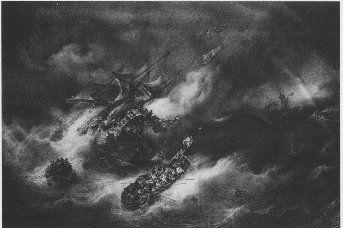
Fig. 13. Théodore Gudin, The Burning of the "Kent," 1838. Oil on canvas, 102 × 164 inches (259 × 417 cm). Musée de la Marine, Paris

(fig. 11). Whether a viewer feels that Gudin achieved his goal, this marine possesses a vivid intensity not present in paintings of naval engagements and beach scenes the artist produced in the Second Empire, which were more modest in scale and ambition. While he painted a wide variety of sea motifs in his later years, none approached the impact of his earlier compositions.