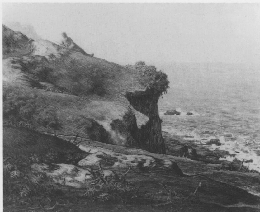
Fig. 14. Jean-François Millet, The Cliffs at Gréville , 1867. Pastel on paper, 17½ × 21¼ inches (43.5 × 54 cm). Ohara Museum, Kurashiki, Japan

oping their new techniques in the laboratory of the seacoast. Among them were artists who would eventually achieve fame—and change the course of art history—including Manet, Daubigny, Millet, Jongkind, Boudin, Monet, Gustave Courbet, Berthe Morisot, and Frédéric Bazille. Many of these artists are examined at length elsewhere in this book, so here I will contend with just a few noteworthy examples.