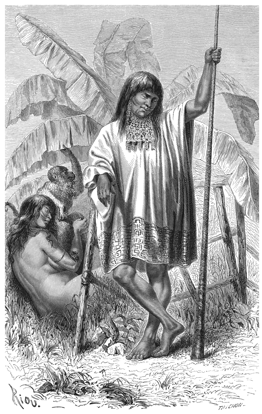
Figure 2: Conibo warrior with captive woman, mid-1800s.