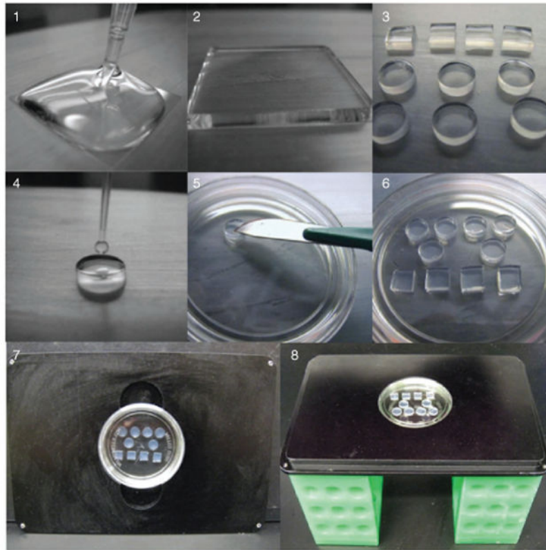
Figure 1. Slide preparation. (1) Melted agarose is pipetted onto a cover glass (22 mm 2 ). (2) Two cover glasses make an agarose ‘sandwich’ of even thickness. (3) Smaller agarose pads are cut from a larger pad. (4) Bacteria are loaded on top of the pads. (5) After drying, pads are flipped and transferred to an imaging dish. (6) Many pads can be loaded on a single dish. (7) After sealing with Parafilm or grease, the dish is placed into a custom stage insert that holds the dish tightly. (8) When manufactured precisely, the stage insert can be turned upside down without the dish falling out, thereby allowing imaging with an upright microscope.