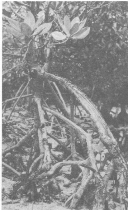
Plate 2: Bruguiera gymnorhiza ( Rhizophoraceae ) Msindi, Muia, Mkifu (Swahili). Note that the pneumatophores are distinctly kneeed or knee-shaped. (Photo: J.O. Kokwaro, Gazi, 1969).