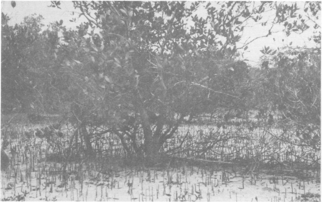
Plate 1: Avicennia marina ( Verbenaceae ) Note the numerous breathing roots (pneumatophores) (Photo: J.O. Kokwaro, Vanga, 1969).