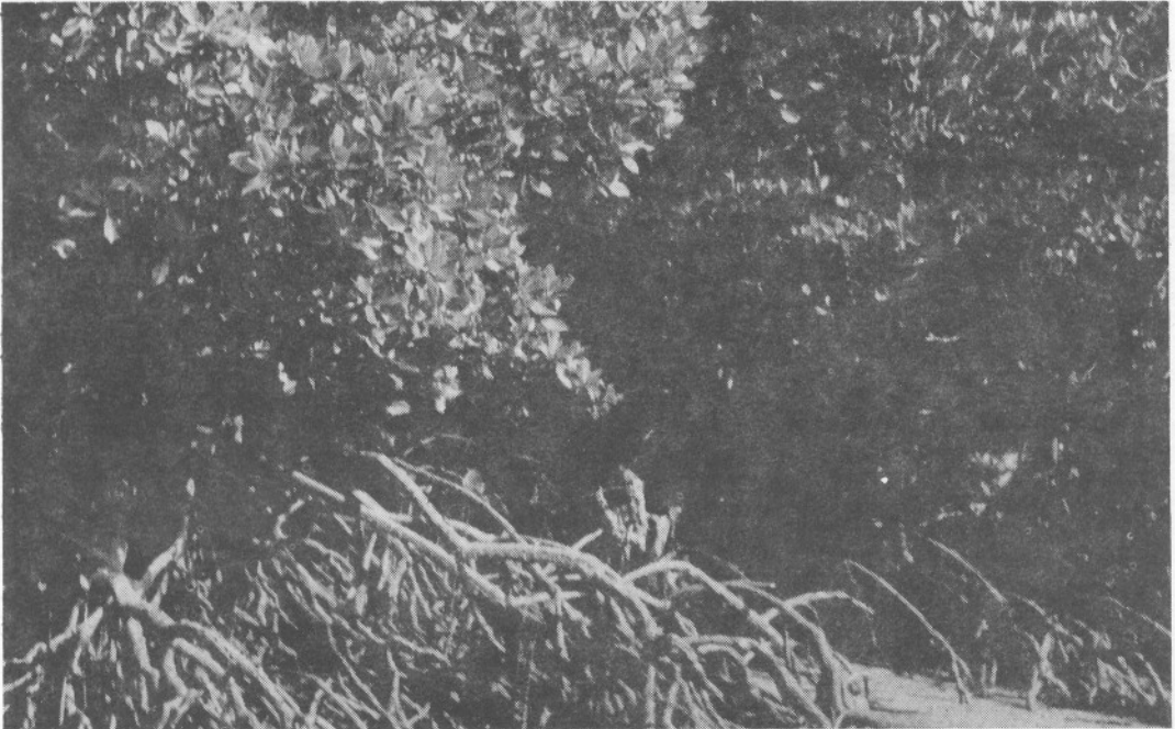
Plate 3: Rhizophora mucronata ( Rhizophoraceae ) Mkoko (Swahili). Note the numerous branched stilt-roots with root caps at the end, tap root abortive. The leaves are fairly similar to those of Bruguiera . (Photo: J.O. Kokwaro, Gazi, 1969).