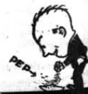
Figure 4.1: Page 16 of the Baptist Advance , April 12, 1923. Southern Baptist pastors were encouraged to provide the state Baptist newspaper to their congregations as a means of increasing congregational contributions to denominational activities. Leaders promised pastors that this would increase pastoral salaries, as well.