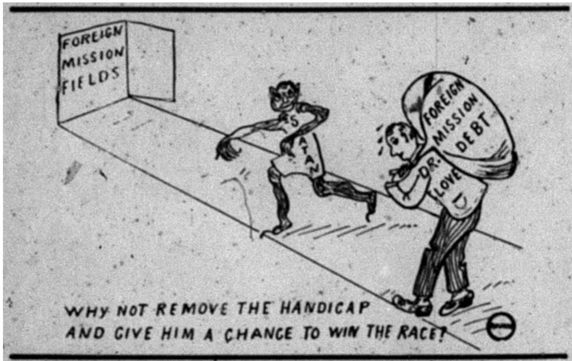
Figure 6.3: Untitled Cartoon, Baptist Messenger , March 18, 1925.

“SATAN” is outrunning him. A caption sums up the appeal: “WHY NOT REMOVE THE HANDICAP AND GIVE HIM A CHANCE TO WIN THE RACE?” 8