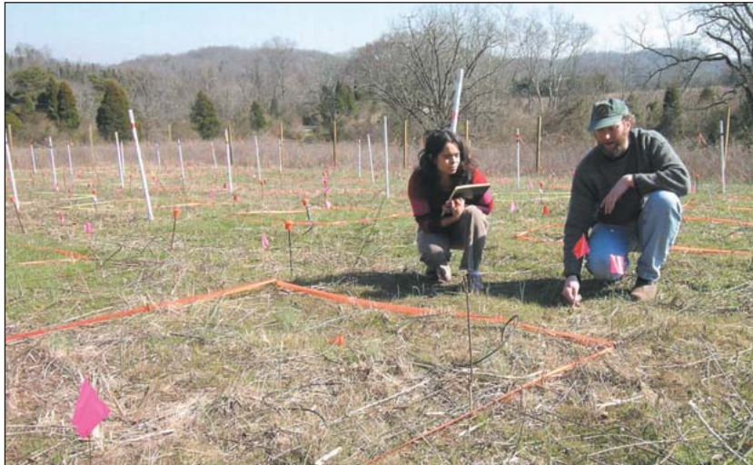
Figure 2. Intellectual contribution in ecology can be difficult to quantify because field technicians or undergraduate students may provide important, informal observations that can easily be under-acknowledged by principal investigators. The informal contributions may drive future research, direct data analyses, and contribute to manuscripts. Communication among potential contributors before, during, and after a project is critical to ensure assignment and acceptance of responsibility. Each contributor is responsible for drafting his or her own byline; the guarantor is responsible for evaluating each byline relative to the others, and for maintaining internal consistency.

willing to be held accountable for its contents and not be just responsible for a portion of the work involved. In contrast, an acknowledgee may contribute formal or informal ideas to ongoing projects, collect enormous amounts of data, and develop and/or conduct statistical analyses, but may not be accountable for the final contents of all or even portions of the final manuscript. Open communication about the roles, responsibilities, and expectations for authors as opposed to acknowledgees should be ongoing during the writing process.