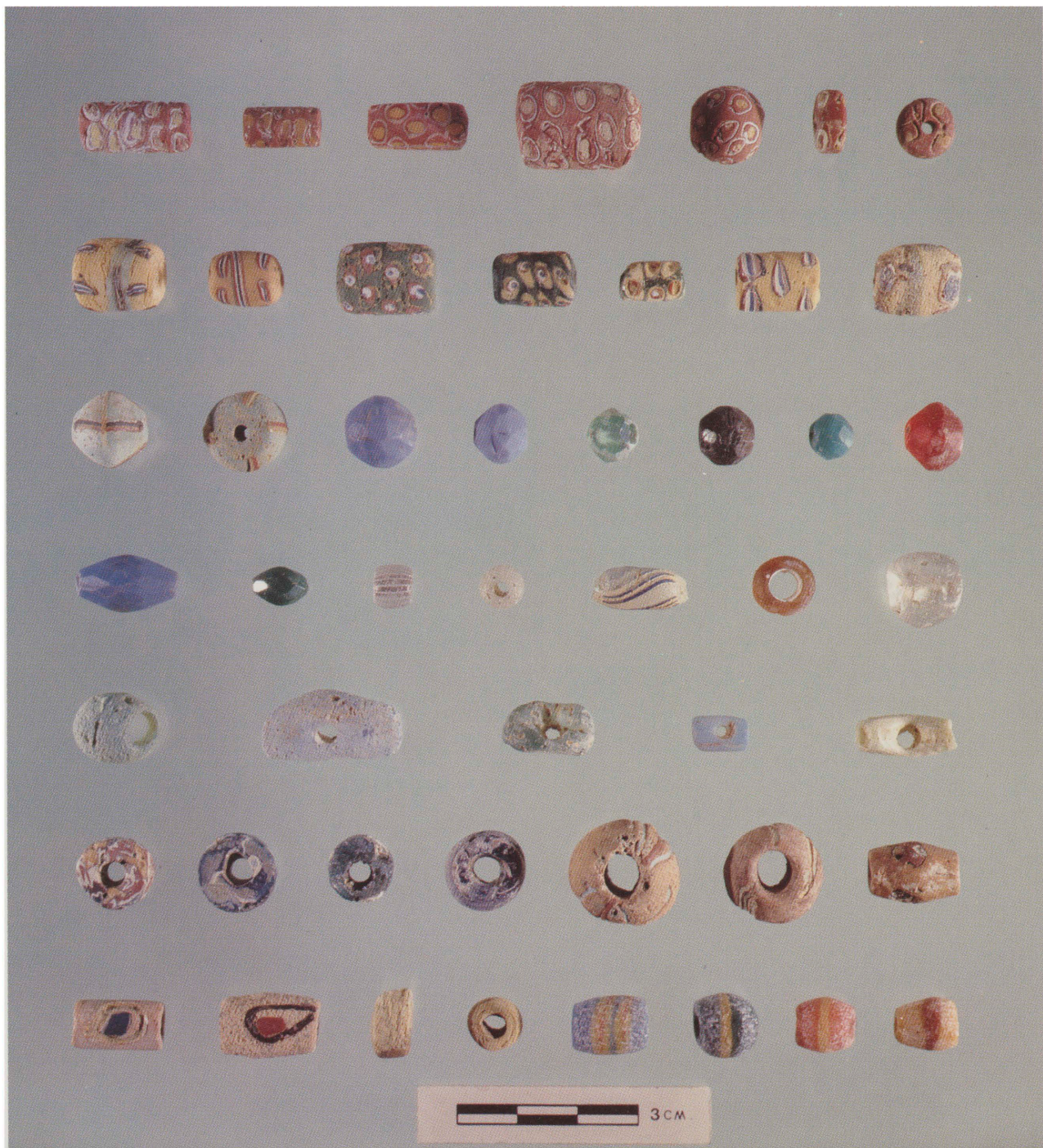
Plate IIB. Elmina : Diagnostic glass beads.