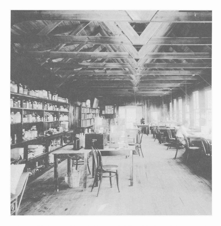
A view of the interior of the main laboratory building of the Carnegie Institution of Washington Department of Marine Biology, Loggerhead Key, Tortugas, Florida, ca. 1918.

in the Papers from the Tortugas Laboratory of the Carnegie Institution of Washington while Mayor was in charge of the station, and more than one dozen of them were reports of Mayor's own research.