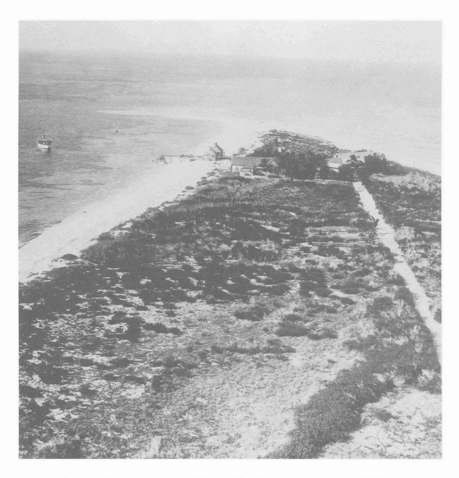
Aerial view of the laboratory buildings of the Carnegie Institution of Washington Department of Marine Biology, Loggerhead Key, Tortugas, Florida, July 1921. Mayor's note on the back of this photo points out (left to right) "the dock; the kitchen (this side); the dining room (far side of dock); the men's quarters (crew, etc.); water tank and toilet beneath; the old lab (tar paper roof); the dormitory."

ous problem was the threat of tropical storms. In fact, Mayor kept the laboratory open only from late April until the first of August because of the higher incidence of hurricanes in August and September. Even so, a tropical storm was an ever-present threat, and, in 1907, one arose so suddenly that Mayor and his associates barely had time to board the yacht and flee before a raging wind that severely damaged the laboratory buildings and drove the yacht a hundred miles away from its port. Hurricanes ravaged