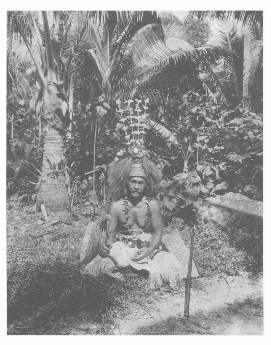
"The High Chief of Anaa," Anaa Island, Tuamotu Archipelago, French Polynesia, 1900.