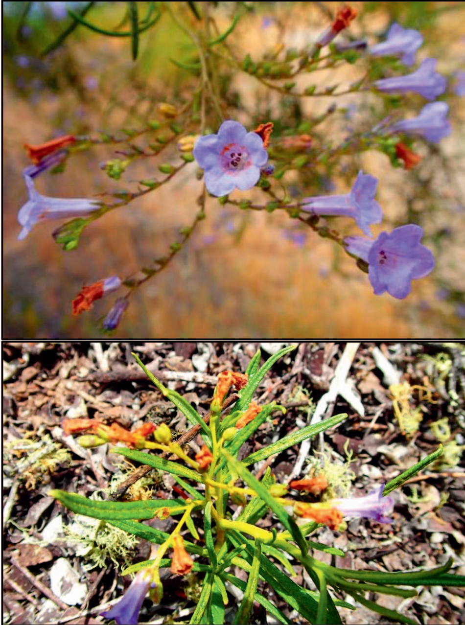
Fig. 3. Upper: Flowers of Indian Knob mountainbalm Eriodictyon altissimum on a tall individual, southwest Guidetti Ranch, San Luis Obispo County, California (occurrence 5), 4 May 2016. Lower: An individual of Indian Knob mountainbalm that is only several centimeters tall and with flowers at southwest Guidetti Ranch (occurrence 5), San Luis Obispo County, California, 5 May 2016.