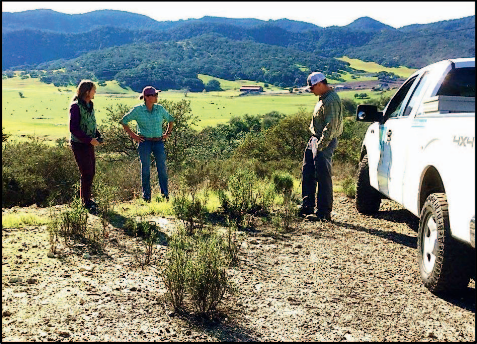
Fig. 7. A colony of Indian Knob mountainbalm Eriodictyon altissimum beside the dirt/rock road in south central Guidetti Ranch, San Luis Obispo County, California (new occurrence 8), 1 December 2016. The colony is 1.14 km southeast of the nearest colony of occurrence 5 on southwest Guidetti Ranch (below Indian Knob). The stretch of road at occurrence 8 was covered with soil/rock from below Indian Knob. It seems likely the plants at occurrence 8 originated from individuals that were transported with soil/rock extracted from occurrence 5.

habitat (Gambus and Holland 1988; USFWS 2013b). Regarding occurrence 5 that is mostly in a protected area, 53% (32 ha) is on the private Guidetti Ranch with a conservation easement to the City of San Luis Obispo, 40% (24 ha) is on multiple private properties in Baron Canyon Ranch Estates, and 8% (5 ha) is on private property of Pacific Gas and Electric Company.