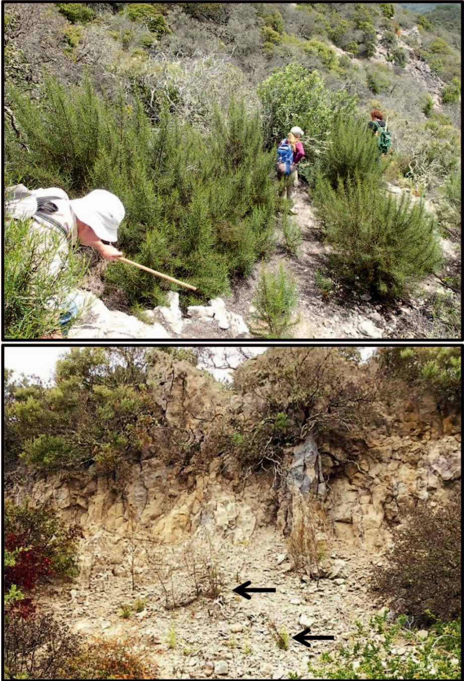
Fig. 6. Upper: A colony of Indian Knob mountainbalm Eriodictyon altissimum growing on an old rockslide on a steep slope of Indian Knob mountain, southwest Guidetti Ranch, San Luis Obispo County, California (occurrence 5), 5 May 2016. Lower: A colony of Indian Knob mountainbalm growing in fallen rock debris of a crumbling cliff face on Indian Knob mountain, southwest Guidetti Ranch, San Luis Obispo County, California (occurrence 5), 4 May 2016.