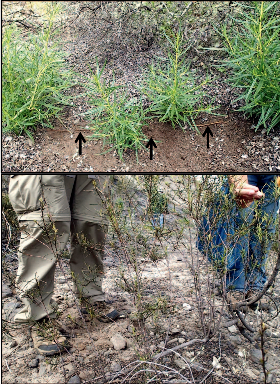
Fig. 4. Upper: Ramets (the vertical stems) produced from underground rhizomes (indicated by black arrows) of Indian Knob mountainbalm Eriodictyon altissimum at southwest Guidetti Ranch, San Luis Obispo County, California (occurrence 5), 5 May 2016. Lower: A collapsed individual of Indian Knob mountainbalm growing in an open area along the old graded dirt/rock road on the main ridge of Indian Knob mountain, southwest Guidetti Ranch, San Luis Obispo County, California (occurrence 5), 5 May 2016. New vertical stems have sprouted from the primary stem, which is now horizontal on the ground.