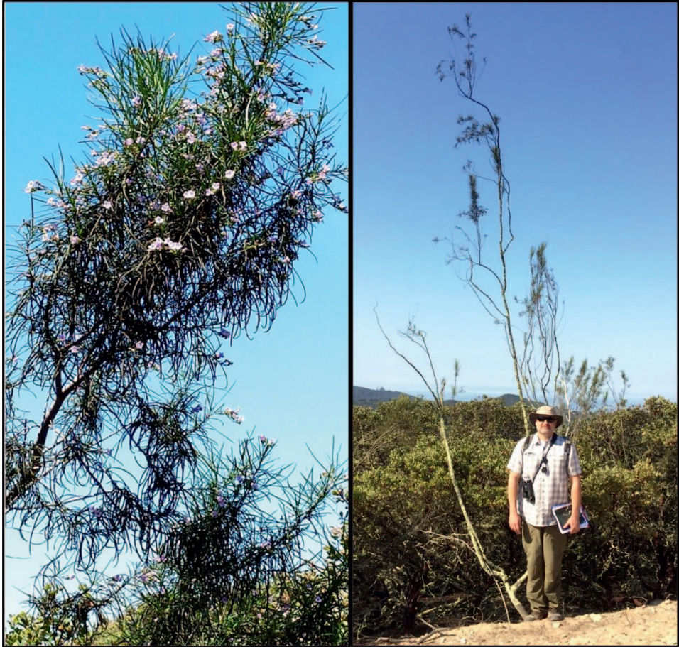
Fig. 1. Left: A tall individual of Indian Knob mountainbalm Eriodictyon altissimum with flowers in Morro Dunes Ecological Reserve East in Los Osos, San Luis Obispo County, California (occurrence 6), 20 April 2016. Right: An extraordinarily tall individual of Indian Knob mountainbalm rising above the mature chaparral comprised predominantly of Santa Margarita manzanita Arctostaphylos pilosula at Baron Canyon Ranch Estates (previously occurrence 7, now part of occurrence 5), San Luis Obispo County, California, 27 July 2016. The foreground is recently cleared and graded. Brandon Sanderson of California Department of Fish and Wildlife is 1.88 m tall. By extrapolation, the individual of Indian Knob mountainbalm is determined to be ~5.5 m tall.

Native Plant Society 1 . At Federal listing in 1995, Indian Knob mountainbalm was known from six occurrences, two of which were in protected areas, with a total population estimate of <600 individuals (USFWS 1994). Five of the occurrences were small and reported to each comprise <50 individuals, and the largest occurrence on the private Guidetti Ranch was reported to comprise <350 individuals (USFWS 1994). Three of these occurrences were on private properties, two were on land owned by the State of California