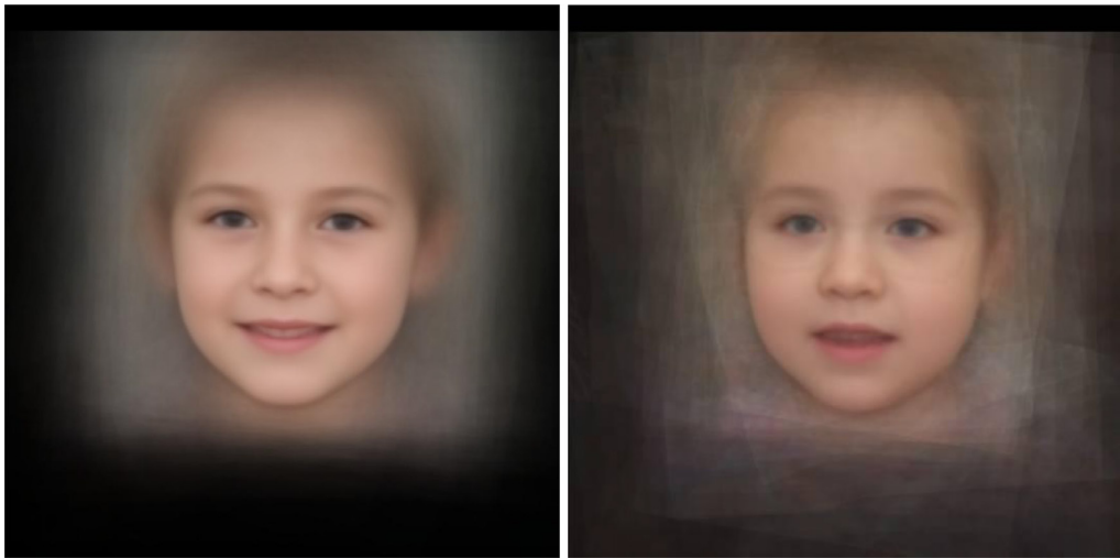
Figure 3 Computational analysis of photographs of PURA (purine-rich element binding protein A) syndrome individuals. Result of an objective computational analysis on photographs of 34 individuals with PURA mutations (ages at photographs ranging from 2 months to 19 years; right image) compared with the average image based on 301 age-matched, healthy controls (left image). The computational modelled PURA face showed a hypotonic face with typically open mouth appearance and full cheeks. Additionally, two independent dysmorphologists reported a slightly abnormal shape of the eyes as (1) shorter palpebral fissures and (2) eversion of lower lateral eyelids. The high anterior hairline observed in a subset of individuals is not visible on this computational model of the PURA face.

stereotypic hand movements and excessive hiccups in utero have not been reported in literature before. Using the summarised clinical information (online supplementary table 2), we calculated the frequency of clinical features in all 54 individuals (table 1).