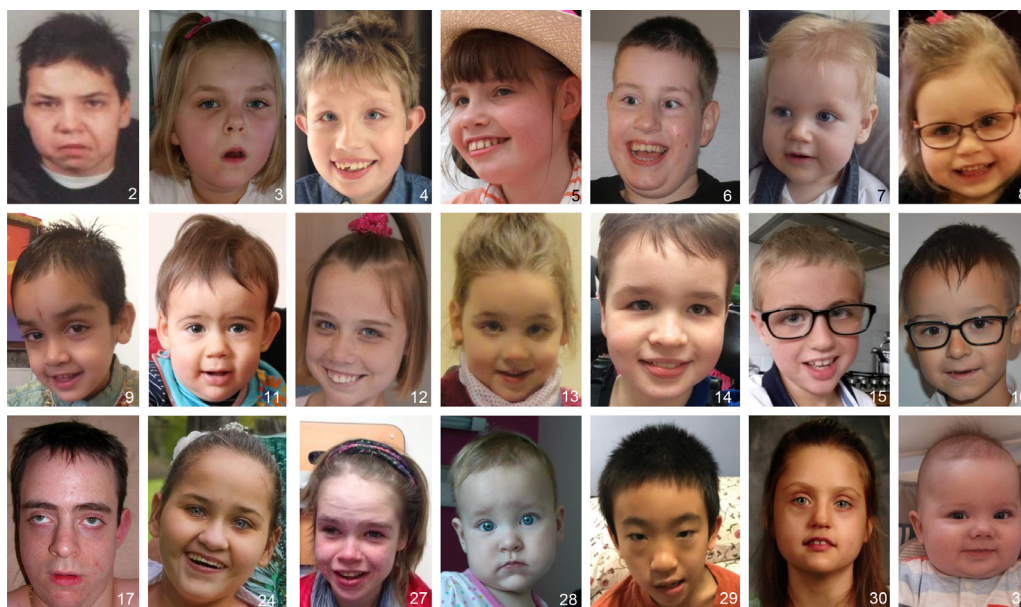
Figure 2 Photographs of 21 individuals with PURA mutations. Shared facial dysmorphism includes high anterior hairline, almond-shaped palpebral fissures, full cheeks and hypotonic face. Strabismus is present in several of the PURA (purine-rich element binding protein A) individuals. Additionally, independent dysmorphologists also observed eversion of lower lateral eyelids, prominent, well-defined philtrum and retrognathia in a subset of the individuals.

Clinical features such as neurodevelopmental delay, epilepsy, and brain and ophthalmological abnormalities have been reported in all previously published cohorts. But for the majority of features, no clinical information is available across all previously published cohorts. For example, hypersomnolence,